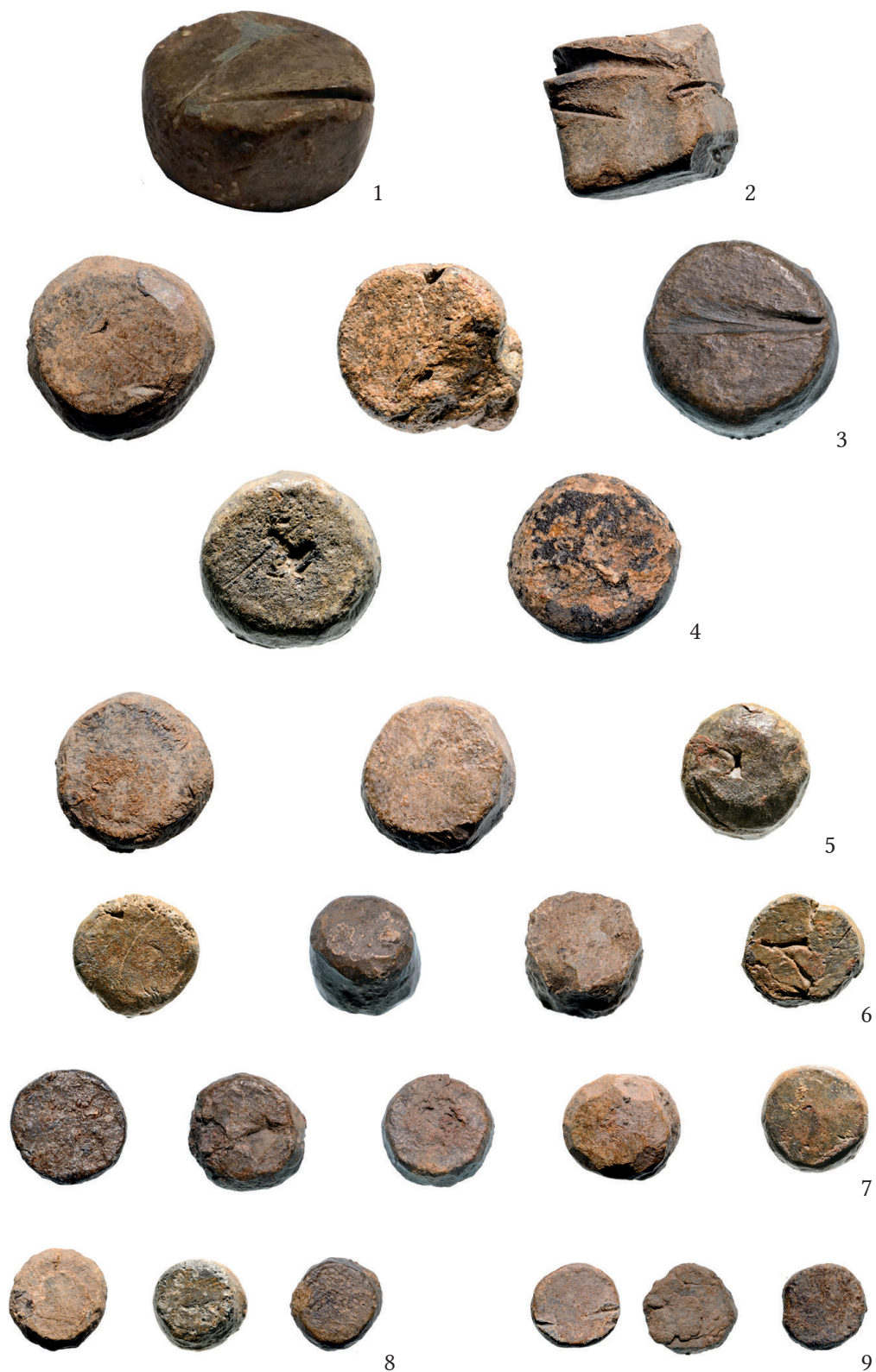
Fig. 3. Lead weights from the site of Orosháza–Bonum