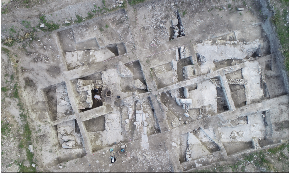
Fig. 3. The porta praetoria during the excavation.

Our excavation has confirmed the results of the geophysical measurements ( Fig. 2 ): the gate of the porta praetoria consisted of two rectangular gate towers with considerably massive stone foundations, however only a few stone blocks of the rising walls have remained in place ( Fig. 3 ). Thus, we only have limited knowledge of the inner structure of the towers; we could identify the traces of a later reconstruction in the western tower while in the eastern tower we discovered a massive chalky layer which could be related to a reconstruction or possibly the demolition of the tower.