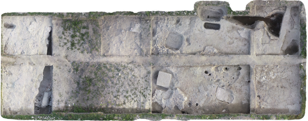
Fig. 6. Ortophoto of the southern excavation surface with pillar bases flanking the via praetoria.

Dating is considerably difficult due to the fact that the gate towers have most probably been dismantled already in the Roman period. Also, the excavation of 1941 as well as drainage construction works in the 1950s have significantly disturbed the environment of the gate. As a result, we could not gain accurate information during the excavation regarding to the construction or periodisation of the gate; hopefully the evaluation of the find material will contribute to a more precise picture.