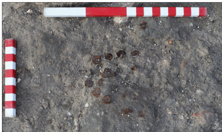
Fig. 9. Iron nails from a caliga.

The 2019 excavations, beside providing new information on the topography of the legionary fortress regarding the porta praetoria and the via praetoria , were also significant from a methodological point of view as they allowed the verification of the results of geophysical surveys conducted in the area earlier, thus contributing greatly to the planning and fine-tuning of future measurements. 8