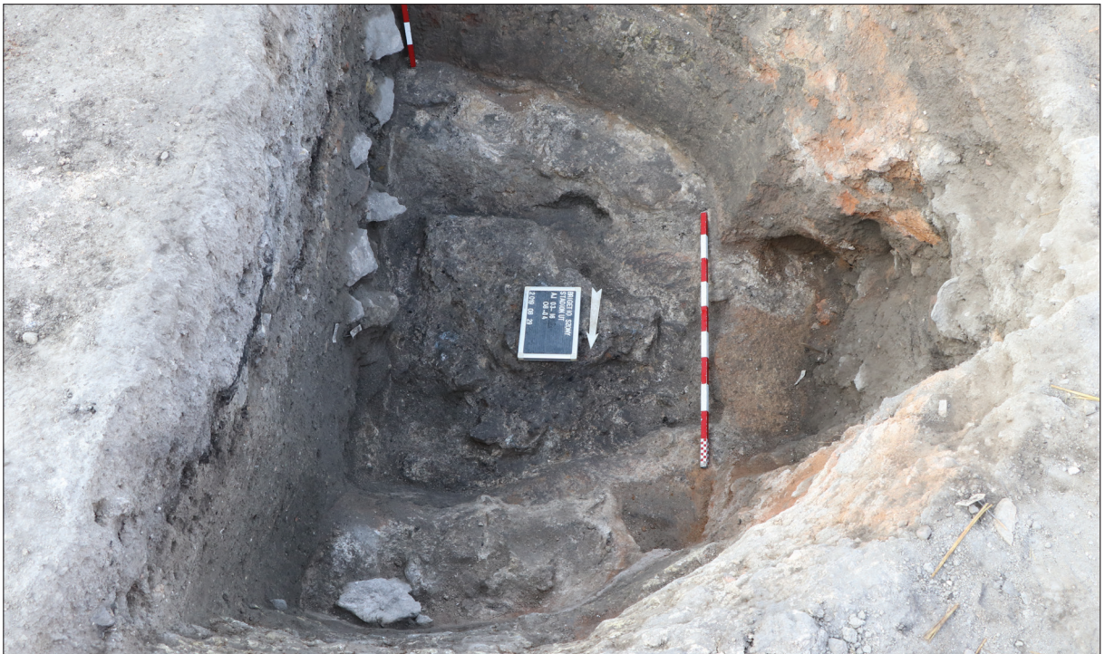
Fig. 7. The Late Roman lime kiln.

The second excavated location was situated slightly to the south of the porta praetoria , along the via praetoria . Only a few stone slabs covering the main road of the legionary fortress remained in their original place, however we have excavated four pillar bases belonging to the row of pillars flanking the via praetoria (Fig. 6), which were also clearly visible on the GPR images. East of the main road we have unearthed a late Roman lime kiln (Fig. 7), which had been