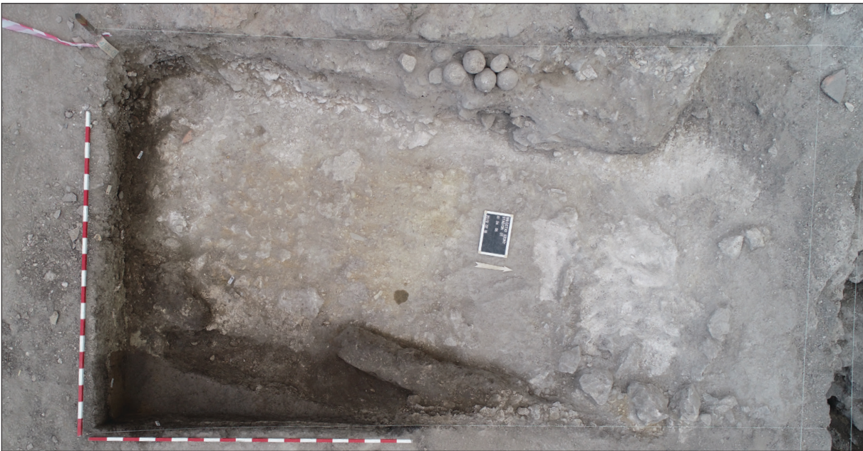
Fig. 8. Stone balls from the eastern tower in situ.

filled with debris and litter after being abandoned. From the upper levels of its filling more than a hundred roman coins came to light. A few metres to the west of the lime kiln two Migration Period graves represented the period following the abandonment of the legionary fortress.