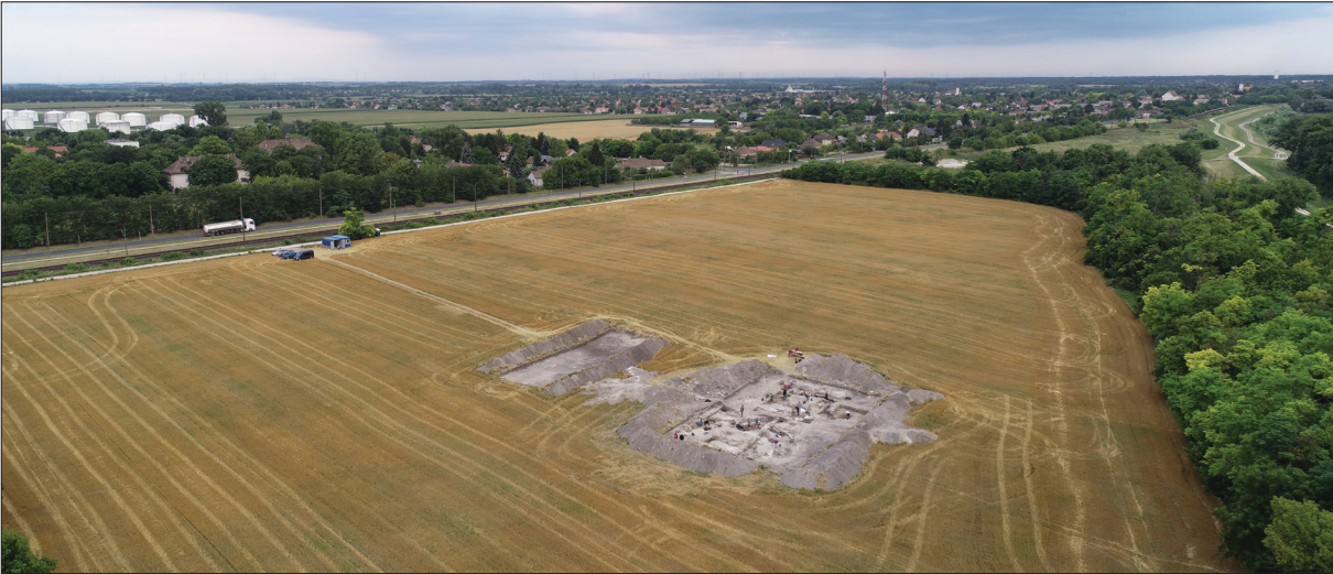
Fig. 1. The praetentura of the legionary fortress of Brigetio with the excavated surfaces.

The first excavated location has been the northern main gate of the legionary fortress, the porta praetoria . In this area there already was a small-scale excavation in 1941 led by Aladár Radnóti during which a section of the gate towers were unearthed, however the excavation's documentation has gone completely lost. 3