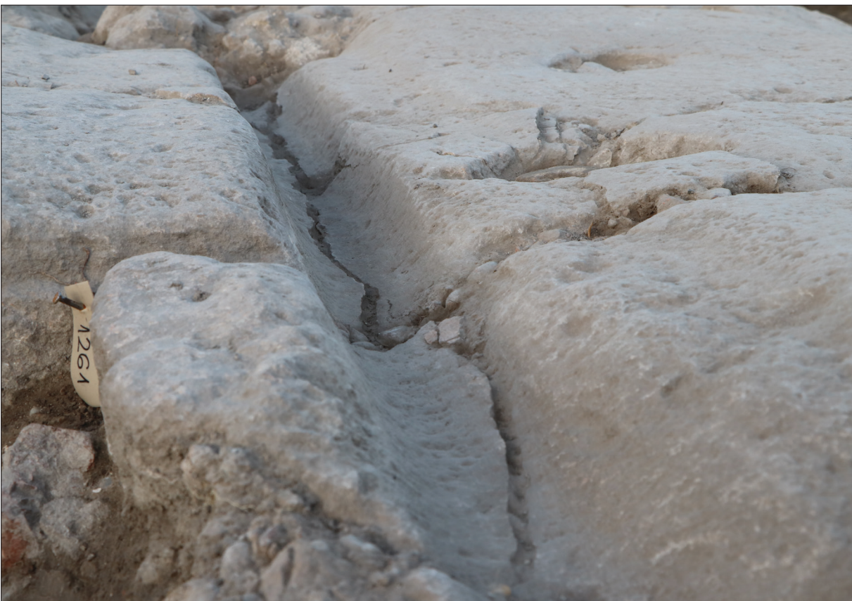
Fig. 5. Ruts of cartwheels in the gateway.