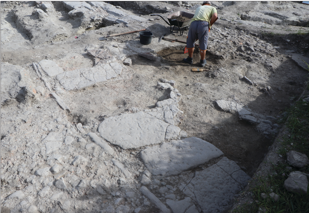
Fig. 4. Stone slabs covering the via praetoria (Photo: D. Bartus).