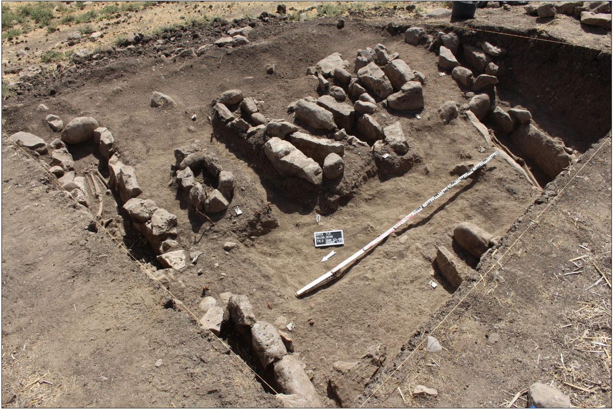
Fig. 2. Field II. The later graves of the cemetery.