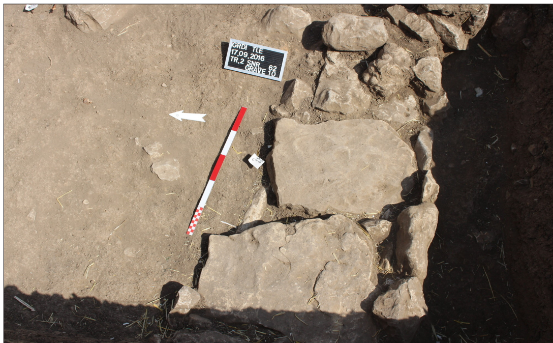
Fig. 5. Grave No. 10.

and 0.70 m long stone slabs which were complemented with smaller ones, while the shorter side was closed with a single stone. The walls of the casket were not outright vertical, their upper part inclined slightly outwards at the eastern part, and inwards at the western part which remained in the trench wall. The covering was consisted of several large, flat stones, the smaller ones, however, placed at the ending, imply that they were put in place after the filling of the gravel pit (Fig. 5).