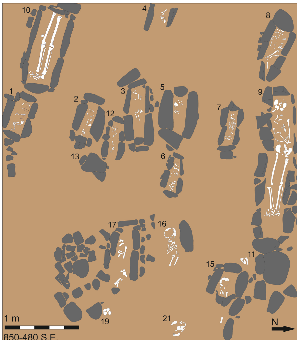
Fig. 1. Field II. The later graves of the cemetery.

filled with earth. The covering was consisted of larger, flat stones: in case of infants, usually a single slab proved to be enough, while the caskets of the adult graves were covered by pieces of various forms, sometimes even roundish stones were used (Fig. 3). The stones were used in unfinished form, that is, as they were found.