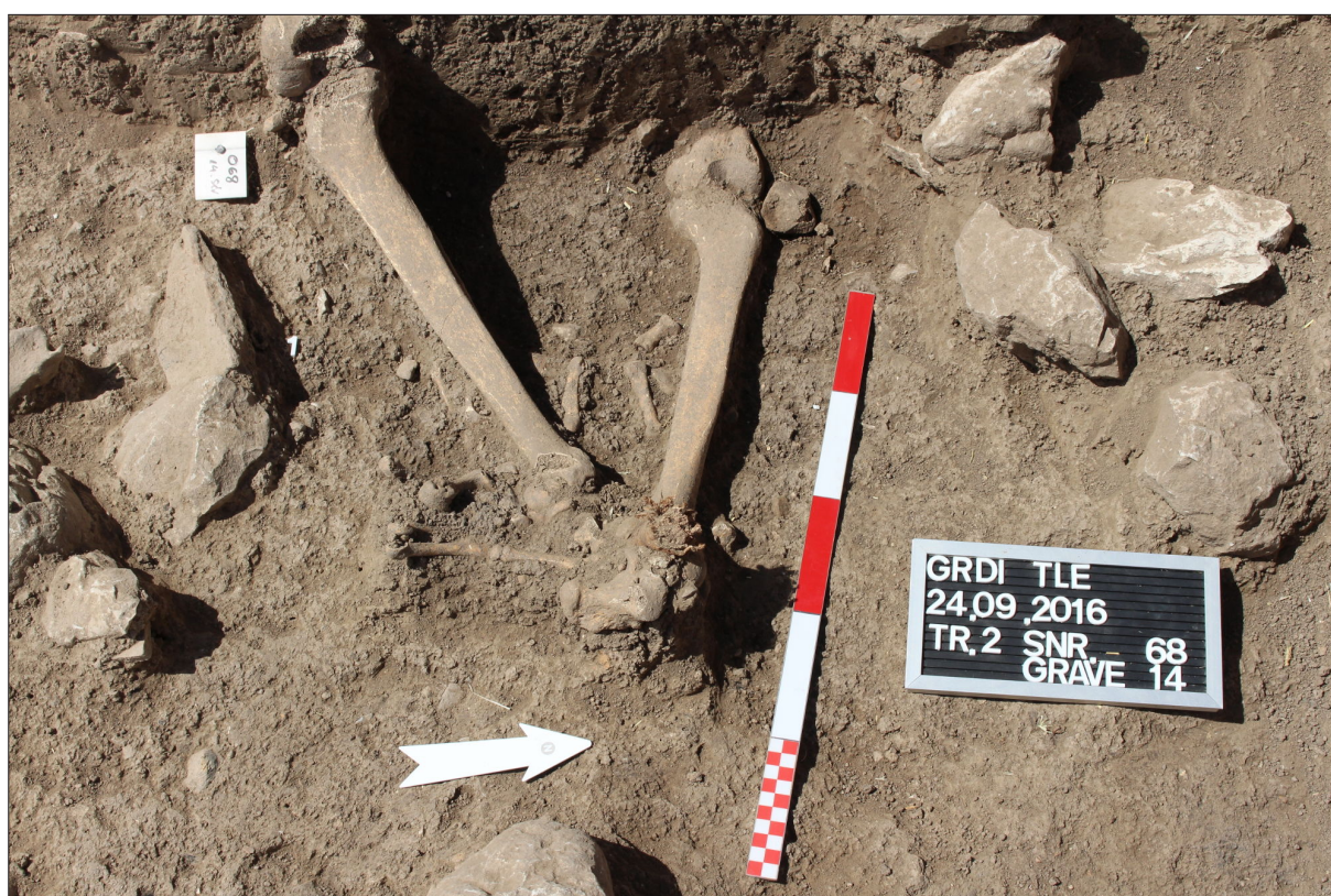
Fig. 7. Grave No. 14.

No grave goods were present; the single iron object may have originated from the filling.