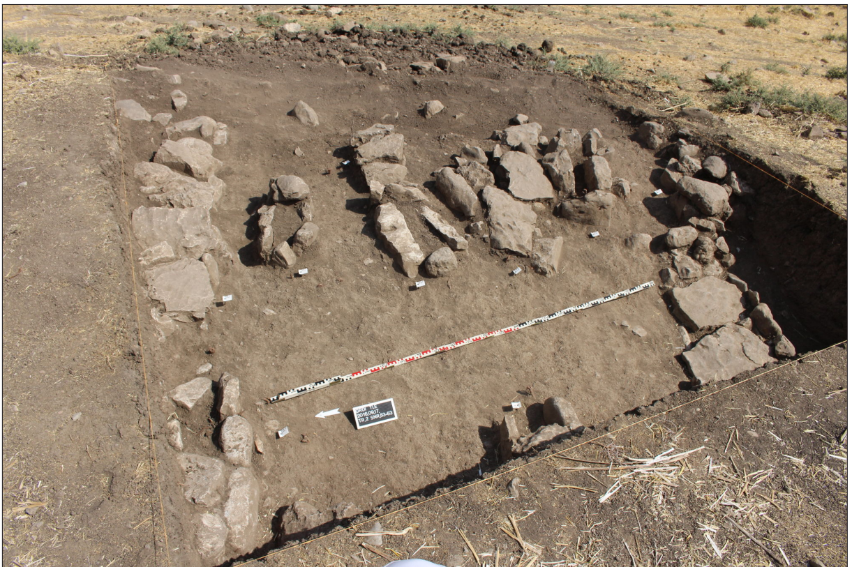
Fig. 3. Field II. The later graves of the cemetery after the removal of the covering stones.