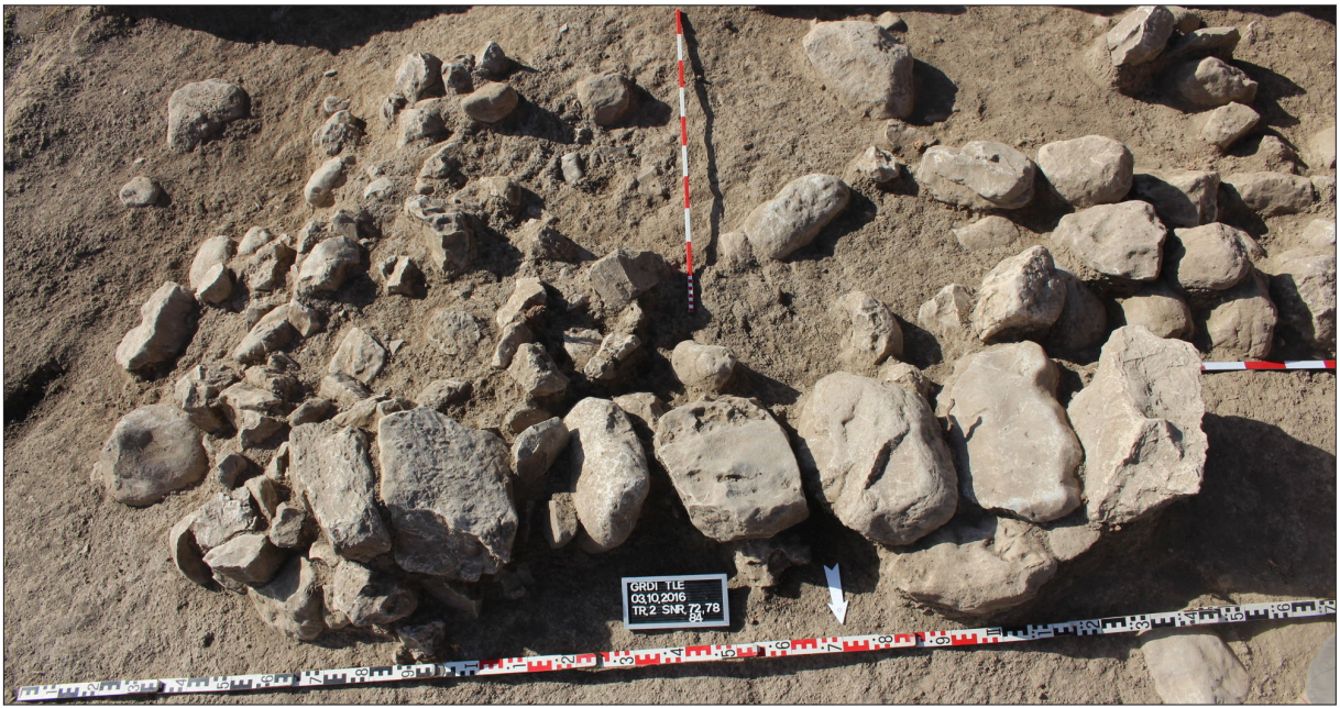
Fig. 8. Grave No. 23.