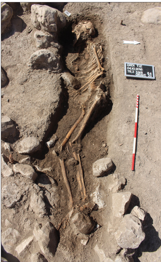
Fig. 9. Grave No. 23.

This grave belongs to the earliest phase of the medieval cemetery. It was situated at the middle area of the trench and was cut next to an earlier wall from the Hellenistic–Parthian period. The funerary ritual differs from the later practice, no stone casket was present, the deceased was laid to rest in a shallow burial pit and consequently the latter was covered by longish, narrow stones which were put across. In this case, seven larger stones were used (Fig. 8). The burial pit did not represent a regular rectangular shape, rather, it was adjusted to the shape of the body and thus it was slightly cambered. Unlike in the case of later adult graves here the whole body was laid to rest on the right side with head towards south (Fig. 9). The bones were well preserved. Consequent to the deposition of the body an oval stone construction, 0.80 m in diameter, was built (SNR 72, formerly grave No. 18), which covered the feet. Thereupon the construction was covered with two larger stones. The proper function of the oval stone construction is unknown.