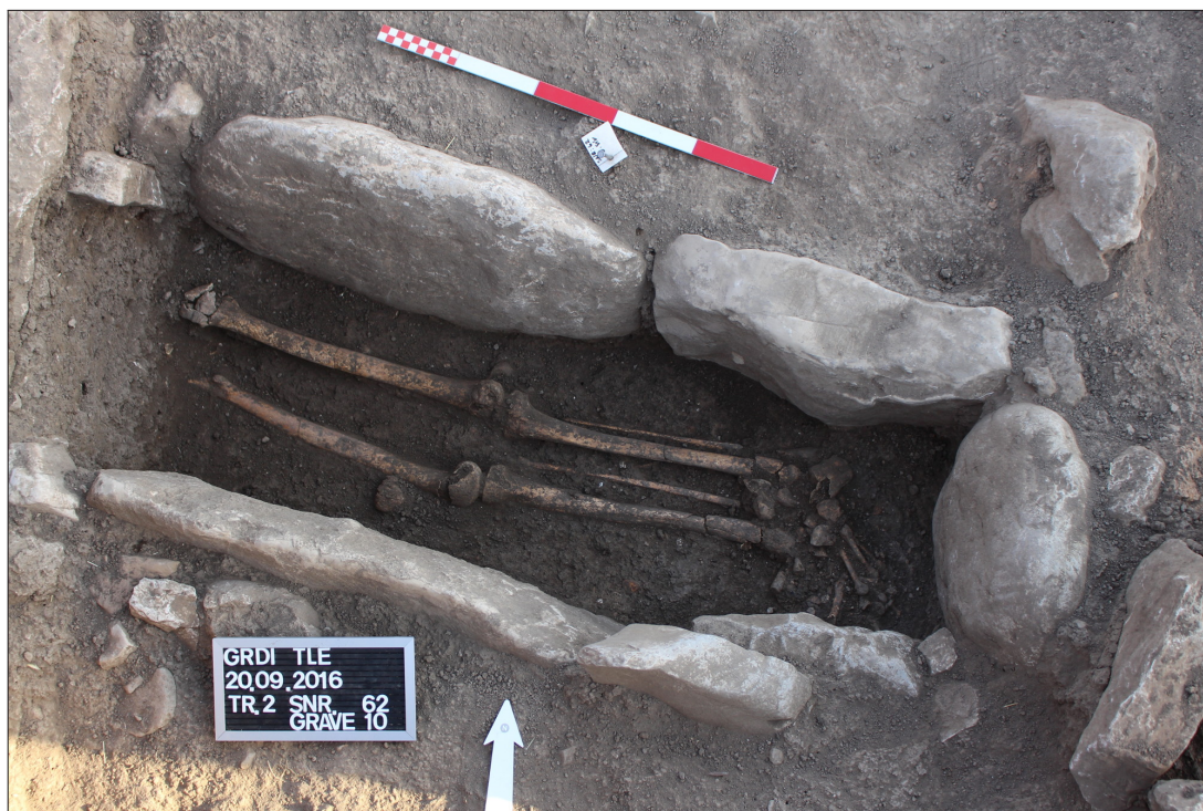
Fig. 6. Grave No. 10.