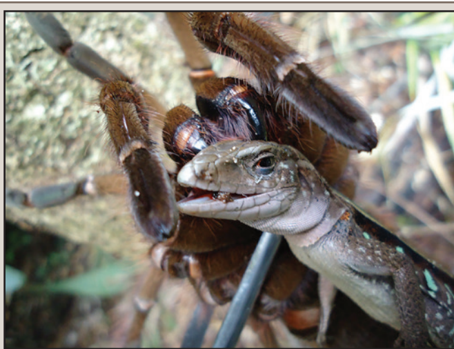
FIG. 1. Theraphosa cf. blondi holding Kentropyx striata in the jaws, at the Municipality of Oriximiná, Pará State, northern Brazil.