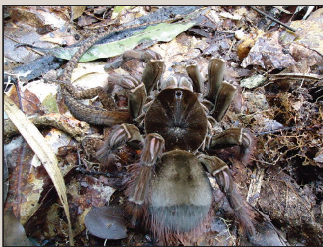
FIG. 2. Dorsal view of Theraphosa cf. blondi holding Kentropyx striata in the jaws, at the Municipality of Oriximiná, Pará State, northern Brazil.