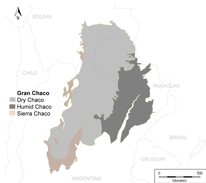
Fig 1. Delimitation of the Gran Chaco ecoregion and subregions.

https://doi.org/10.1371/journal.pone.0220151.g001