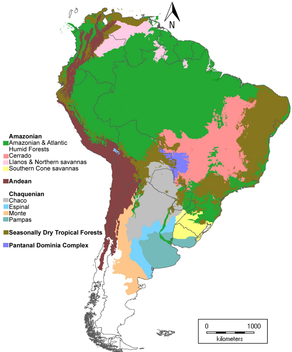
Fig 2. Distribution patterns of the hypothesized lineages (= Domains) of species from Chaco Ecoregion. In total we registered 98 genera, 362 species, and 404 specific and infraspecific Legume taxa occurring in the Gran Chaco ecoregion (Tables 3–5, S1 File). The number of endemisms or exclusive taxa for this region sum up to ca. 17% of the total of recorded species and 17% of total infraspecific taxa (Tables 3–6).

https://doi.org/10.1371/journal.pone.0220151.g002