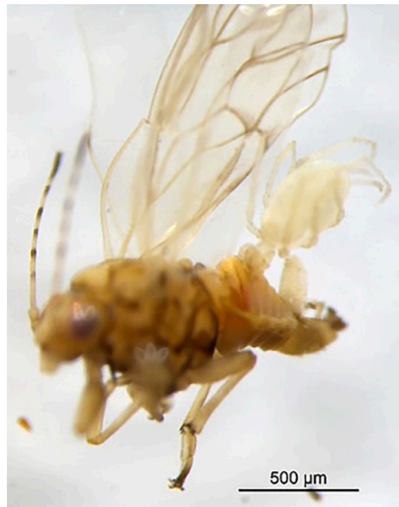
Fig. 1. Larva of Erythraeus sp. firmly attached to the abdomen of Russelliana adunca (color mite after their conservation in 70% ethanol).

The psyllid was preserved in 70% ethanol and one of its forewings was mounted in Canada balsam for the identification using a stereomicroscope Leica S8APO and a microscope Trinocular "Biotraza" XSZ146AT. The studied material was deposited in the collection of the División Entomología of the Museo de La Plata (MLP),