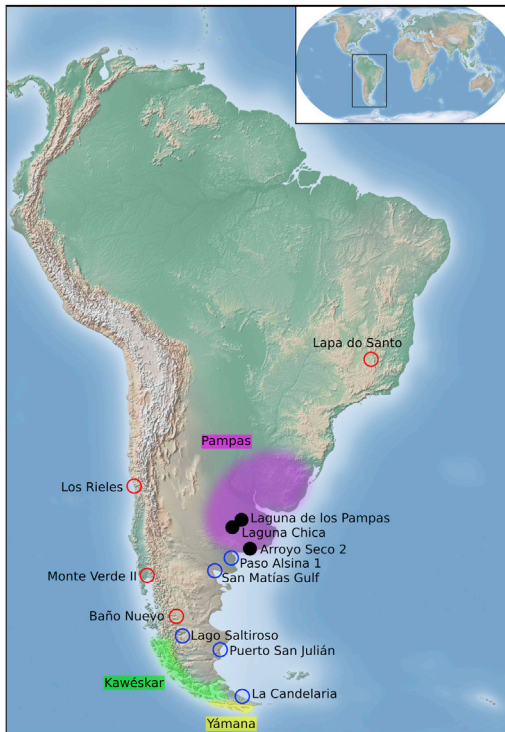
Figure 1. Map of the Pampas region

The three archaeological sites from which samples for this study derive are highlighted (Laguna de los Pampas, Laguna Chica, and Arroyo Seco 2; black circles), as well as other Early (red circles) and Late Holocene (blue circles) sites mentioned in this study. Los Rieles has some samples that date from the Late Pleistocene. Monte Verde II has signs of human activity dating to the Late Pleistocene. The 19 th century territories of the Kawéskar and Yámana populations are shadowed in green and yellow, respectively.