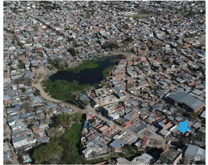
FIGURE 1. Aerial view of Villa Itatí neighborhood, Quilmes, Buenos Aires, Argentina with the lagoon and the pumping station indicated (arrow).

Composite samples (200 ml each 20 minutes) taking in a 6-hour period were collected from 8 a.m. to 2 p.m. in sterilized glass bottles and kept at 4 °C until analysis. During the sampling, the pumping station was in operation, discharging the contents of the lagoon into the sewage network. RNA purification and viral detection were performed the same day of the sample collection. Before processing, samples of 500 ml were subjected to 90 minutes treatment at 60 °C to ensure biological