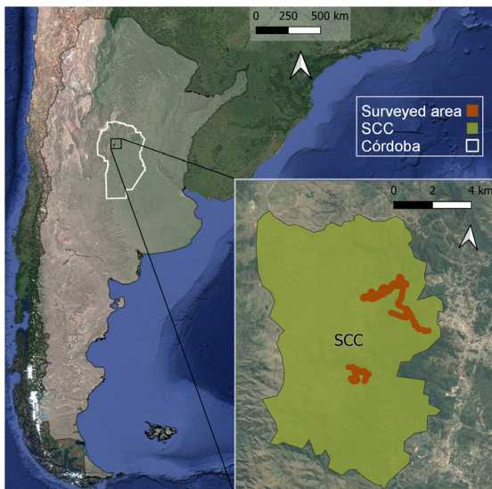
Figure 1. Map showing details of the surveyed area in central Argentina. Córdoba province is delineated in white and the Sierras Chicas Corridor (SCC) is represented as the green area inside the box. The area where owls were searched (surveyed area, ~250 ha) is indicated in dark orange.