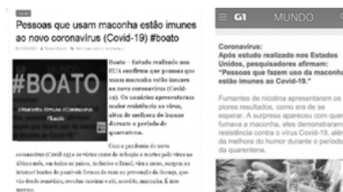
Figure 2. Screenshot 1 of the article written by Pair 1

A news that has spread widely through the media in Brazil is that marijuana can immunize a person against the new covid-19, A print screen simulating being from a report circulates on social media that says a study in the United States concluded that people who smoke marijuana are immune to Covid-19. The text says that cannabis users, unlike those who smoke ordinary cigarettes, have been resistant to the coronavirus. but this is just a big lie, not a study has been done on marijuana that proves that it generates any benefit that can cure the coronavirus, these fake news can be very dangerous and usually spread very quickly, there have been recorded cases of deaths due to self-medication that was passed through a fake report.