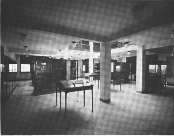
MUSEUM OF PATHOLOGY