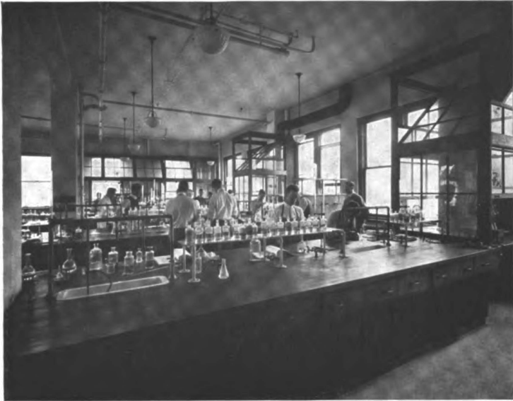
CLASS LABORATORY OF THE DEPARTMENT OF BIOLOGICAL CHEMISTRY