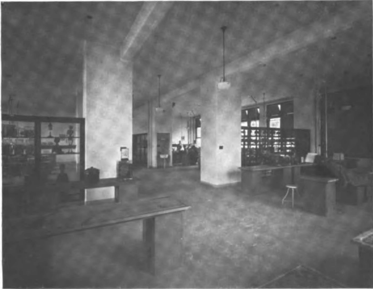
DISSECTING LABORATORY OF THE DEPARTMENT OF ANATOMY