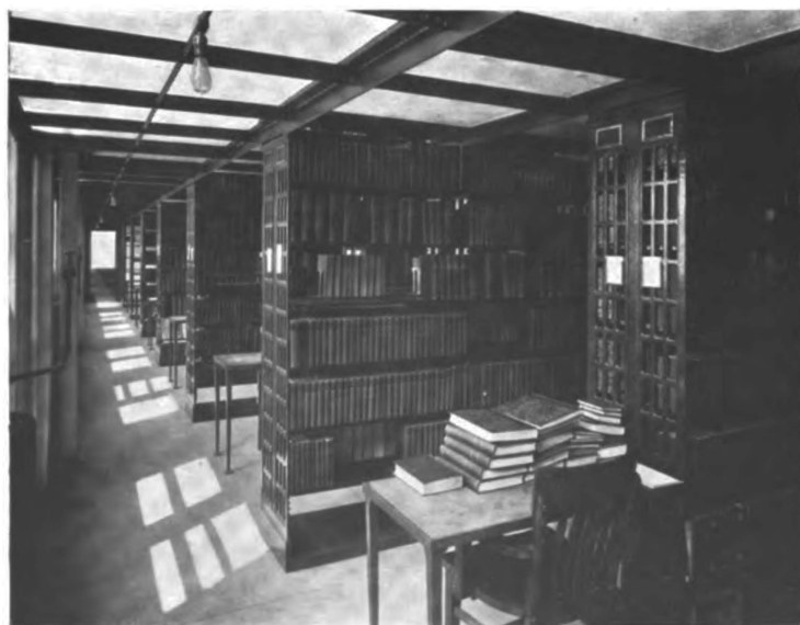
STACK ROOM OF THE LIBRARY