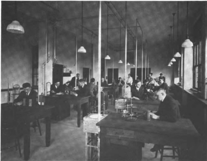
CLASS LABORATORY OF THE DEPARTMENT OF PHYSIOLOGY