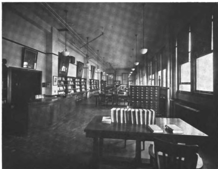
READING ROOM OF THE LIBRARY