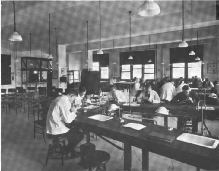
CLASS LABORATORY OF CLINICAL PATHOLOGY