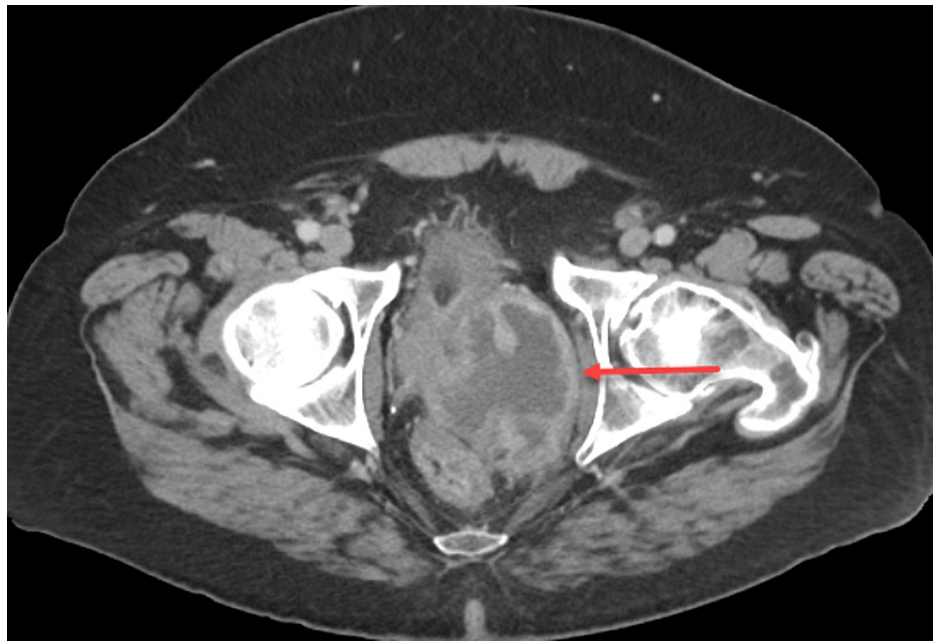
FIGURE 1: Axial CT pelvis showing enlarged prostate (9.6cm) (red arrow) with a mass effect on the rectum and bladder