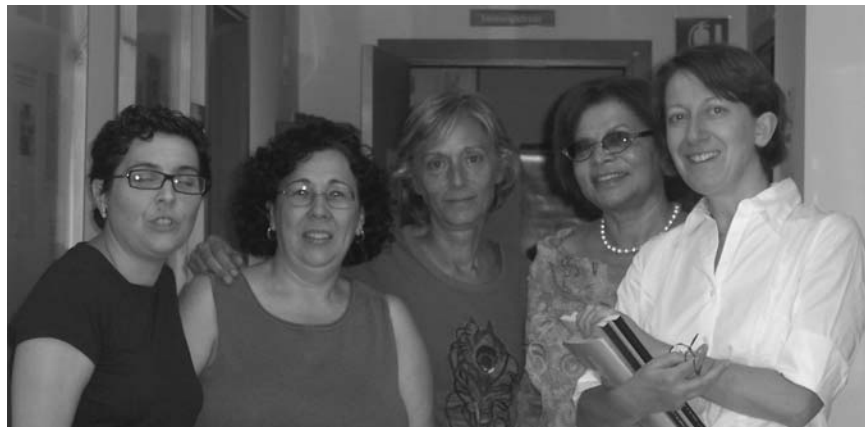
FIU Delegation to the University of Granada, Spain