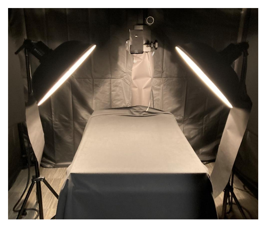
Figure 2: Copy stand setup with two modeling lights