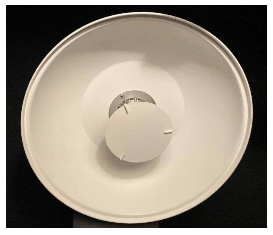
Figure 1: Profoto beauty dish reflector.

sides of our copy stand and approximately 55 inches from the floor. We experimented with using diffusion panels with our Profoto Zoom 2 adjustable spotlight reflectors, but, as we learned conceptually as we experimented more with the FADGI process, diffusion lowers detail and reduces color accuracy, which is bad for reproducing text. We tested many angles and decided that 45-degrees provided the best result. The ideal height and distance of the lights will change based on the size of the object being digitized. As always, I would recommend experimenting until your target or object is lit most evenly, and then document your process so you can recreate the setup that worked best for you.