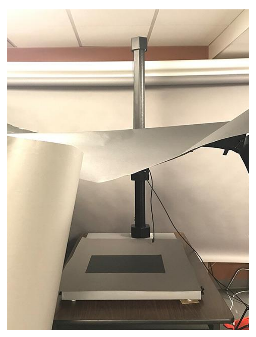
Figure 5. Our paper canopy in an early stage of development.

Shortly after this success, we moved to a carpeted office and set out to achieve 4-stars without post-processing and to plan a more permanent alternative to the paper tent we created. We purchased an 8' x 8' portable photo booth, which had a glossier interior than anticipated. After a little more research, instead of backdrop paper, we chose duvetyne fabric as the material for covering the walls and all parts of the metal frame because of its high opacity and matte finish—we also covered our white copy stand base in the same material. With those adjustments in place, we again achieved 4-stars for color registration and resolution and got very close to hitting 4-stars for tone response without post-processing manipulation. We reached this milestone just before we had to shutter due to COVID-19, but I believe that a few pieces of metal were not completely covered by the duvetyne, or perhaps a black or duvetyne rug could have helped correct tone without having to manipulate the tone curve in software.