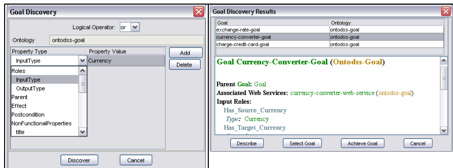
Fig. 2. The Goal Discovery functionality. Users can define search criteria using a logical operator and identifying properties and correspondent values. The search criteria is translated to an OCML expression, processed against the IRS-III Server and presented to the user.

The adoption of mediators gives more flexibility to users, since it is inevitable to select services defined and implemented by different parties while building a composition (in fact, this is a basic requirement to support business interoperation). Therefore, we do not restrict the list of goals that the user can select in each step of the composition, allowing users to define mediators that could perform required transformations between goals.