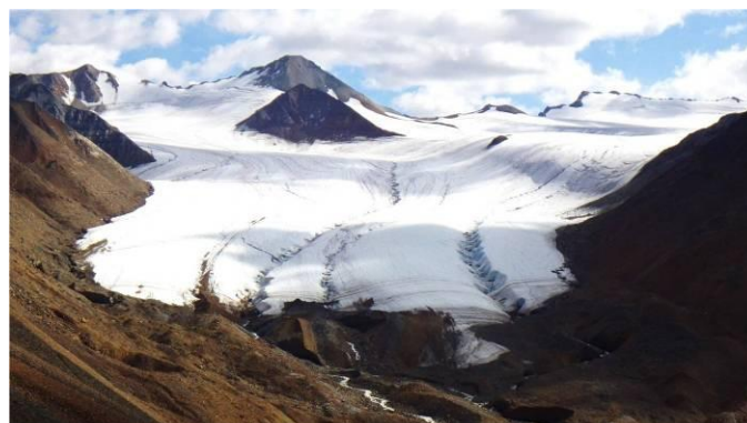
Fig. 2 Photograph of Glacier No. 31 taken in 2013 This glacier was intensively studied by Russian scientists during IGY.