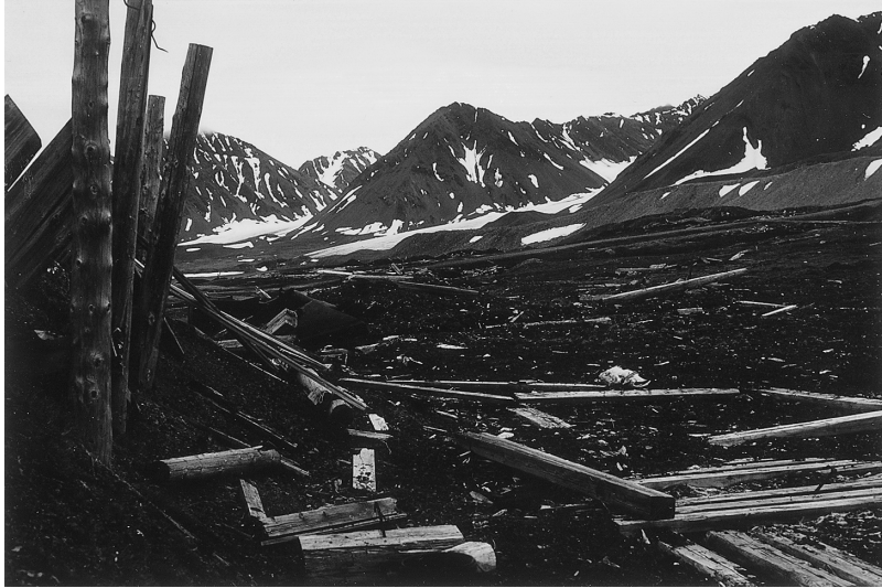
Fig. 1. A vast area of deserted coal mining site on the outskirts of Ny-Ålesund.