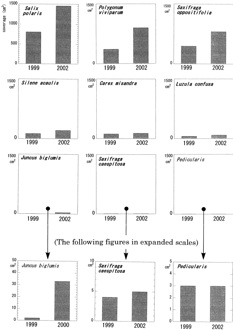
Fig. 3. Diagrams illustrating increase of species cover change from 1999 to 2002.