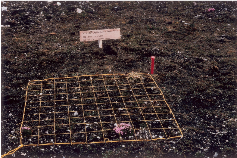
Fig. 2. A permanent plot established in a deserted coal mine to monitor vegetation recovery and succession.