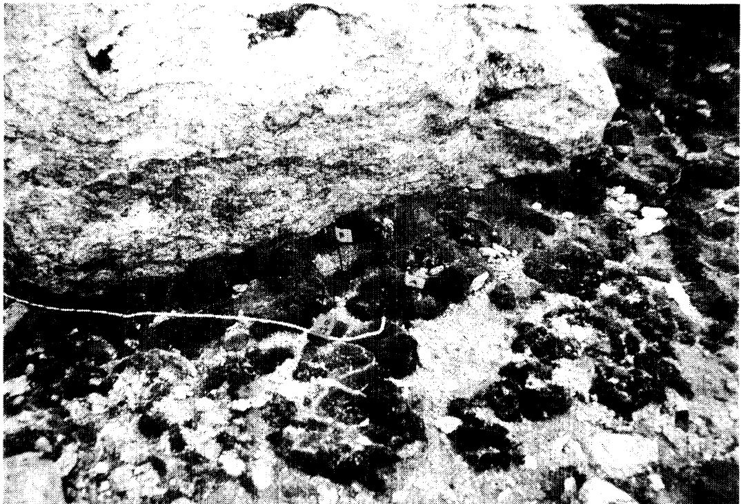
Fig. 4. Close-up of two moss colonies used for the present study.