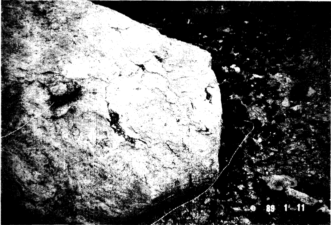
Fig. 3. Moss colonies and rock surfaces used for the present study.