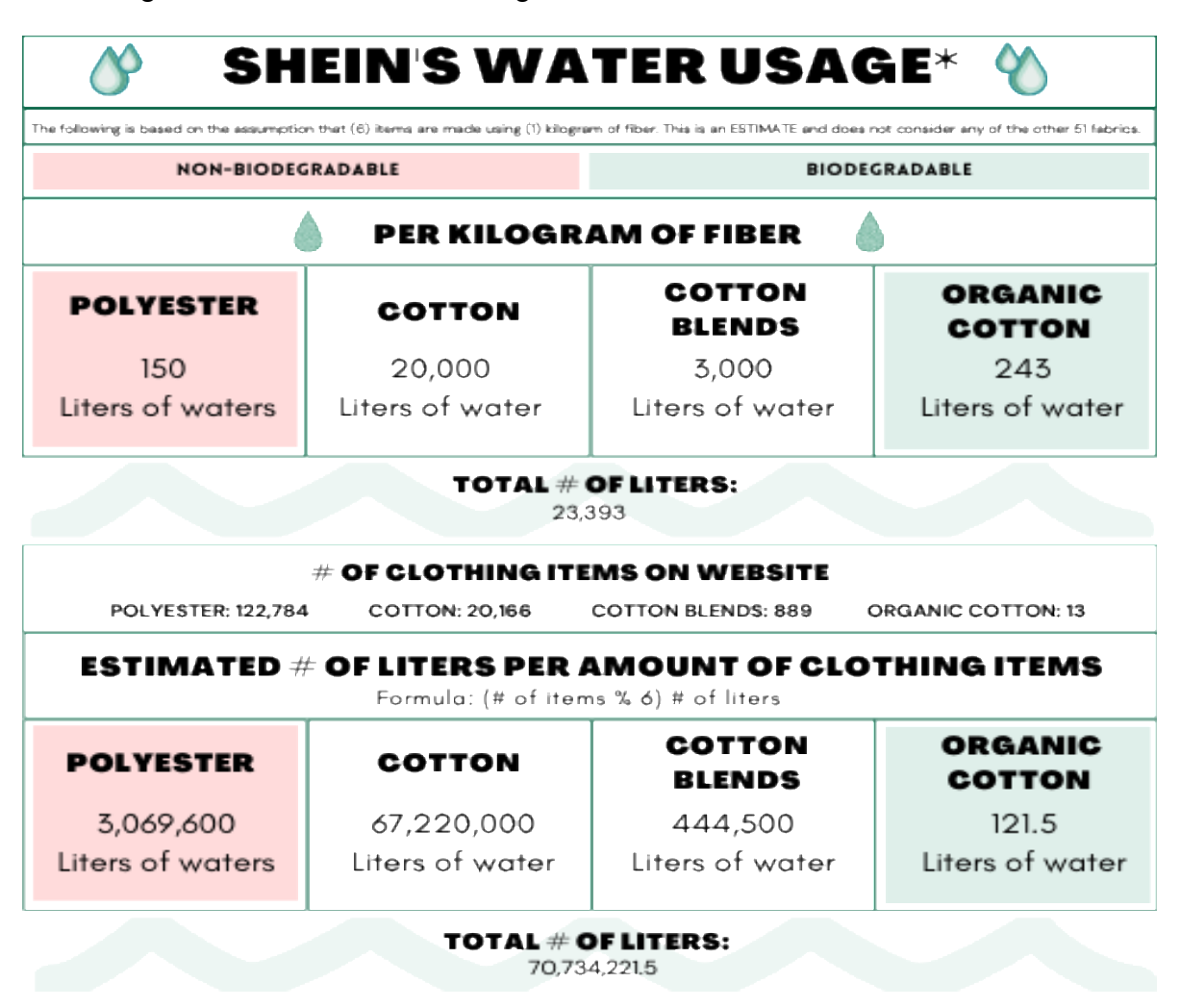
Figure 2: SHEIN's Water Usage

Figure 2 breaks down 4 materials and their water consumption. Polyester alone takes up almost 75% of the clothing materials used by SHEIN. Considering the way Polyester is produced is critical for understanding how it could contribute to SHEIN's lack of or low level of authenticity to sustainability. Another material that is worth considering is cotton's production. While it only takes up 10% of the