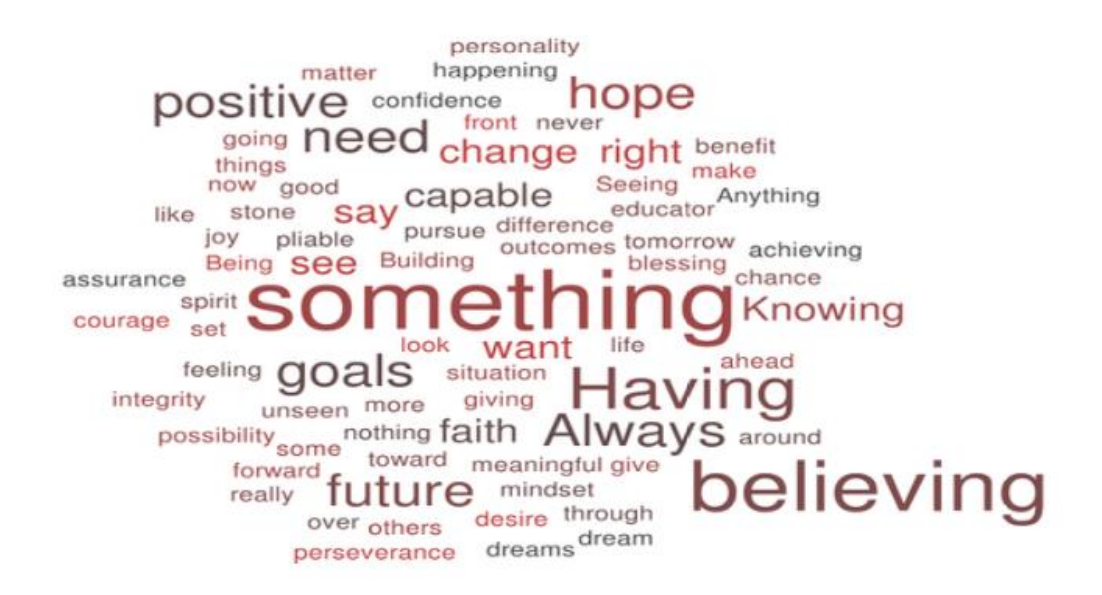
Figure 2 Words Related to Hope as Reflected by Teachers' Voices During the Interview

Themes and Categories The themes identified using hand coding by the primary investigator and confirmed by the co-author of this research study led to the discovery of the manifestations of both positions of hope and hopelessness in teachers' paradigm and pedagogy. Table 1 summarizes the indicators, textual evidence, themes of critical hope, and elements or attributes of critical hope shared by the 10 teachers as they relate to the manifestations of critical hope in teachers' paradigm and pedagogy.