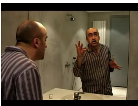
Figure 1: A frame from the short film 'Buongiorno', used as a pre-text for the process drama.

wakes up in the morning to discover that his own reflection in the mirror is alive. The protagonist goes back to sleep, and the viewers are led to believe that those images were nothing but a nightmare; however, a daunting twist reveals this to be his real-life condition, featuring a grotesque 'nightmare-within-the-nightmare' sequence which will ultimately terrify him. The film is silent, except for one word uttered by the mirror reflection: 'Buongiorno!' ('Good Morning'). The soundtrack of the film, by composer Ennio Morricone, is more eloquent than any dialogue to create a mood of suspense, trepidation and angst.