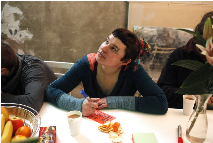
Figure 4: Fig. 4. Tenants at a Pärflexionmeeting.

The Potsdam-Berlin power lab aimed to focus its research on the practices of self-organization and the further improvement of these practices. While student researchers from FHP conducted participant observation in the tenant spaces, arranged interviews and wrote reports on their findings, the power lab team invited volunteering tenants to the ‘Pärflexionmeetings’ (a wordplay on Pächter, Perzeption, Reflexion), where they were regarded as coresearchers. They were introduced to how they could plan, observe, and reflect on activities using an action research model, and explore their practice in terms of an interplay between aims, reflection and action. At first, being primarily focused on their activities, the tenants were not interested in this kind of research, but gradually got engaged and prepared the meetings in cooperation with the facilitators of Schlesische27 and, later, sometimes even called them ‘PAC-meeting’ (an acronym from Pächter, Action and Vitamin C), which sounds like ‘pack’, a word signifying a cool gang, but (in German) also meaning to grab, to seize or tackle something.