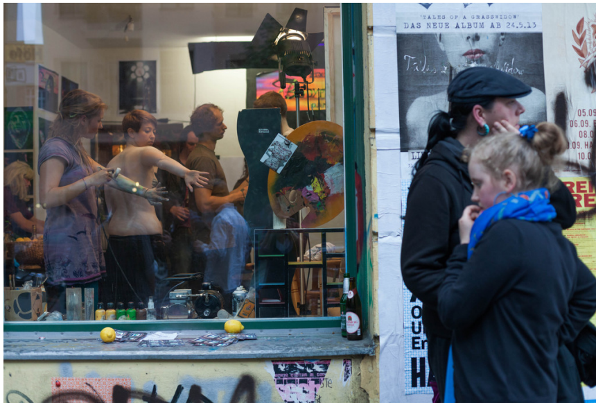
Figure 1: Fig. 1. “Schlesi19”, tenant space in Berlin-Kreuzberg.

Kreative Köpfe // A vacant pub in the Spandauer Neustadt, – a neighborhood in Berlin which has not yet been earmarked for gentrification. Young people furnish the space, start an improvisation theatre group, run a creative writing workshop and set up a photo studio. The activities in this longterm vacant space are being critically observed by the neighbors. The project starts with an opening event at which around 80 young guests are introduced to the forthcoming initiatives. Someone who thinks the invited band is playing too loudly has apparently called the police. The officer, however, remains friendly and finds that the music is hardly louder than the noise coming from the busy street outside: “Oh, I see, it’s a youth project sponsored by the Berlin City Council, well that’s okay then.” It hardly comes as a surprise that, later on, the son of the policeman joins the improvisation group and even the officer himself at some point shows an interest in the various activities going on in the space. The members of the photo group, for example, manage to recruit a friend who is a makeup artist in a theatre. They start to provide a special portrait service for their friends, families and occasional passersby. Famous actors from the world of film serve as a source of inspiration for the somewhat unusual, quirky portraits which the group will show later on in an exhibition.