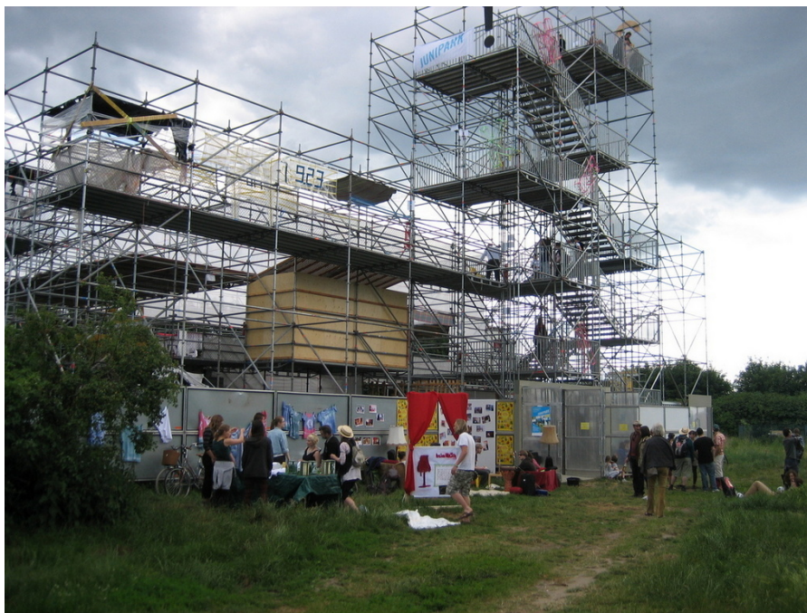
Figure 6: Fig. 6. "Juni Park", the tenant's last domicile on Tempelhofer Feld (© Hanne Seitz).

disputed). It consists of basic architectural structures, cubic spaces (of which some are separated by a white scaffolding net), one big enough to serve as a theatre arena, another one used as a kitchen, and the smaller roomsized ones are the last location for all the tenants coming from the spaces in the different districts to meet, give workshops, organize exhibitions, create theatre, etc. At one point the members of the invited youth theatre group “Die Zwiefachen” (from Schaubühne Berlin) suddenly turn into zombies and start to occupy the surrounding field. “They squeeze all the breath out of you, plan luxury apartments on Tempelhofer Feld,” says the narrator of the show. “But don’t get upset. We’ve done research and know how to deal with this ‘Zombification’. We’ll dig a giant hole, flood it and drown them. Zombies can’t swim.”