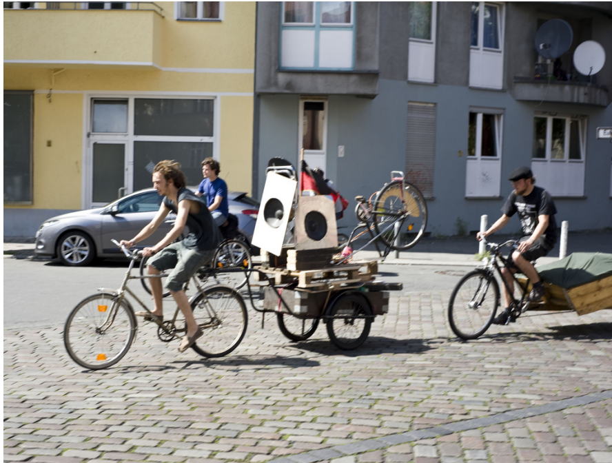
Figure 5: Fig. 5. "Knight riders", clearing a passage to the demo.

creative contributions to the use of the urban sphere. Such an approach calls for facilitators who, like agents, build bridges, mediate and connect people who otherwise would not meet. Such facilitators only get involved on request, unless they decide it is necessary to intervene. This may happen when a group has reached a point of complacency or stagnation. Interventions take the form of artistic impulses and rely on non-discursive presentational, aesthetic settings. Such interventions can help to spur on the group's self-determined activities and encourage the young people to become more involved in art making or community life and, ultimately, contribute to the empowerment of young people.