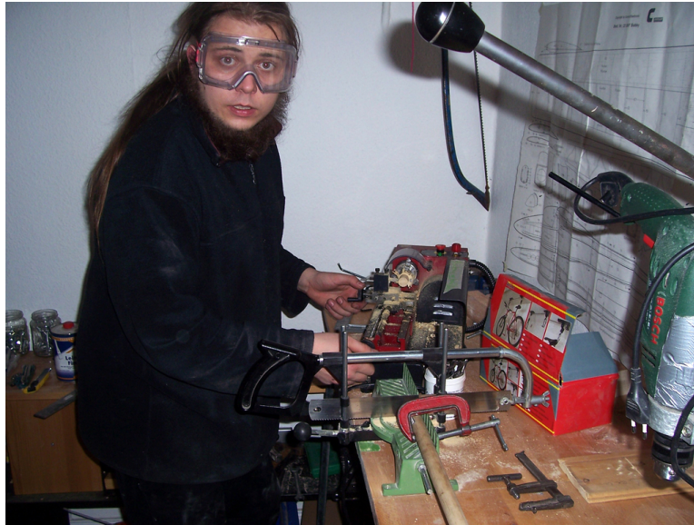
Figure 3: Fig. 3. "Machwerk", tenant space in Berlin-Wedding

In the beginning they were happy enough amongst themselves, but the more the project developed, the more they overcame their inward orientation; they seized the opportunity to become visible, go public and leave their mark. It was inevitable that this involved a great measure of conflict (e.g. with neighbors). The generally functional orientation of adults contrasted with the young people's desire for a playful and sometimes anarchic rearrangement of their spaces and the use of uncommon and somewhat subversive strategies. Similar to a 'bricoleur' they took apart what was given and used the elements to construct something different. The functions of 'inherited' objects, e.g. an old sign on the façade, a counter, an empty tool rack, and some old-fashioned wallpaper were creatively converted. There seemed to be no end to the imagination of the young tenants who, again and again, came up with yet another unconventional use of their spaces.