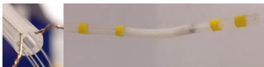
Figure 1: Proximal end (left) and distal articulating section (right) of the catheter

The catheter used for this work (Figure 1) consisted in seven lumens within a 3mm diameter package; four lumens for stainless steel tendons used to deflect the distal tip, two lumens each containing one 5-degree-of-freedom EM tracking sensor (Northern Digital, Inc); and the final lumen is a 1.5mm working channel for instruments such as biopsy forceps or therapy probe.