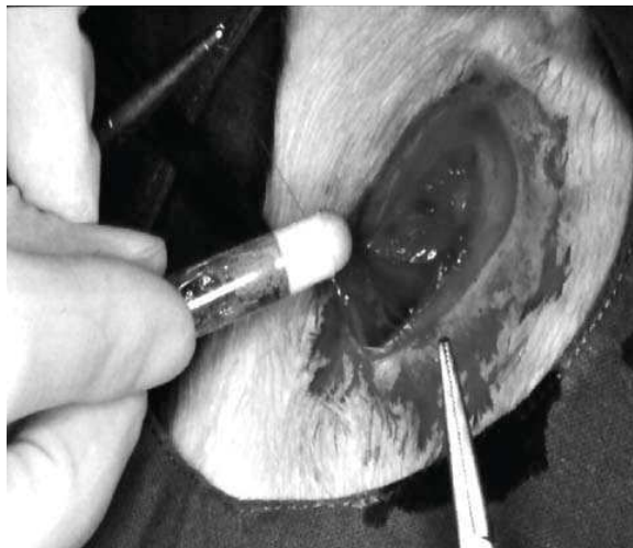
Figure 1.- Application of 2-octyl-cyanoacrylate.

With the object of studying the existence or not of acute inflammation (AI), chronic unspecified inflammatory infiltrate (CUII) and foreign body type granulomatous inflammatory infiltrate (CGII), oedema (Ede) and fibrosis (Fi), the 3 µ thick histological cross sections were processed in paraffin and stained with Hemotoxiline-Eosine.