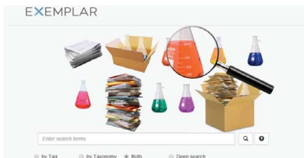
Fig. 2. Experimental information search in EXEMPLAR

users can perform full text searches on the indexed contents of the labpacks. Figure 2 shows the search page of EXEMPLAR.