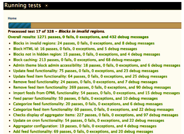
Figure 2: Running Drupal tests

features of the module that contains them. Fig. 3 shows the Drupal features that were considered in our study, 28 in total including the feature root. In particular, we first selected those Drupal core modules that must be always enabled, 7 in total, e.g. Node . In Fig. 3, these features appear with a mandatory relation with the features root and Field . These features are included in all Drupal configurations. A Drupal configuration is a valid combination of features installed and enabled. Then, we randomly selected 20 modules within the rest of the Drupal core modules (e.g. Image ) and additional modules (e.g. Views ). All these modules can be optionally installed and enabled and thus were modelled as optional features in the feature model.