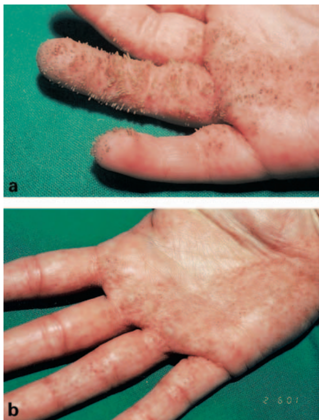
Fig. 1. (a) Numerous verrucous, keratotic papules in linear distribution on the right palm and flexor aspect of the ring and little fingers. (b) Keratotic, comedo-like lesions on the right palm 24 years later.

PEODDN reflects genetic mosaicism and is apparently originated from somatic events occurring during