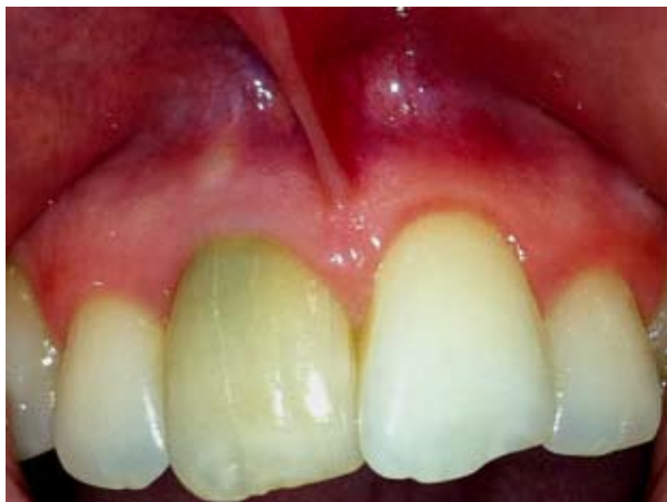
Fig. 3. After 24 months, tooth remains asymptomatic, but a green discoloration was evident.

cal radiographs showed satisfactory healing of the distal radiolucent lesion in the alveolar bone (Fig. 2D and 2E). After 24 months, tooth remains asymptomatic; however a green discoloration is evident (Fig. 2F and Fig. 3).