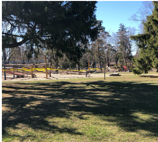
Exhibition Park, Guelph, Ontario, Canada dated April 25, 2020

The photograph demonstrates that spaces that were specifically designed for children were restricted by government agencies (in this case, the City of Guelph parks department). Notable is the appearance of yellow 'caution tape' that is typically used by police services at crime scenes when investigations are taking place and by developers on construction sites when repairs are taking place: the presence of which signals access has been restricted to the area. Commonly, this object is used to manage risk and liability by marking these spaces as 'out of bounds.' In this case, the tape was intended to renegotiate previously established boundaries of childhood space in the community. Playground spaces, designed for children's use, were restricted at the peak of government-sanctioned lockdowns in an effort to curtail further community spread of the disease. As research on the spread of COVID-19 evolved, governments deemed outdoor spaces