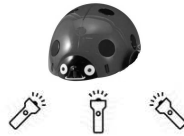
Fig. 1. The figure to explain the task

Task – ladybug: The ladybug of Szeged was designed and built by Dániel Muszka in 1956–1957.