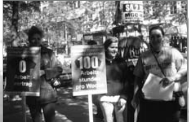
An action at Vienna's center shopping street

CCC action against child labour at Vögele and Jumbo stores Zurich, Bahnhofstr., 25.10.00