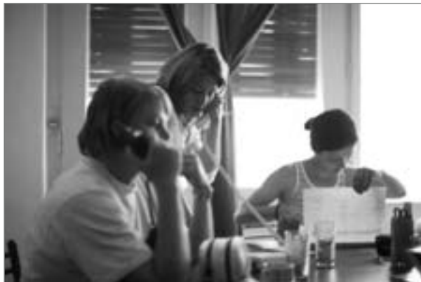
Activists at work, Shtip, Republic of Macedonia

At a national level, it is also very important to develop initiatives for the determination of a legal minimum wage and for the formulation of equal pay for equal work legislation.