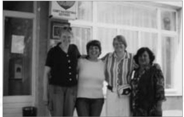
German and Macedonian activists

"Working relationships shall be legally binding and all obligations to employees under labour or social security laws and regulations shall be respected."