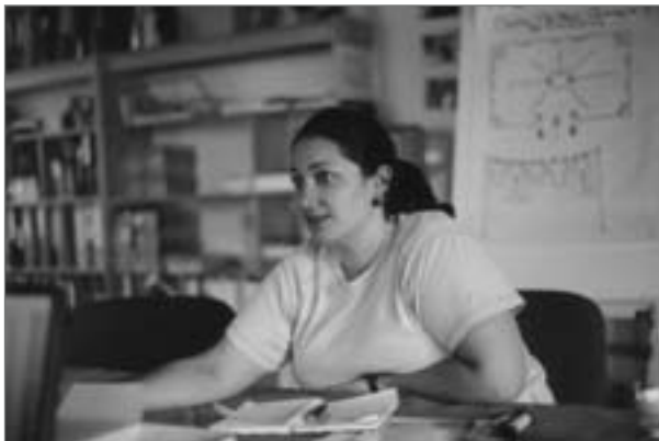
At the office of Women's Alliance for Development, Sofia

The worker interviewed knew of no unions in the factory nor of any attempts to form one. There was simply "no such thing". Every worker has to bargain herself with the employer. Still, she believed that they would stand a better chance of getting "just remuneration" for their work if there was some kind of collective representation of the workers with which to approach the owner. The workers had once requested an air-conditioner to lower the high temperatures in the work space. The owner notified them that this was impossible because he had no money.