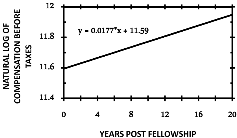
Fig. 1. The relationship between years post fellowship and the natural log of pre-tax annual earnings is described by the equation/linear function derived from a Tobit regression model. The model controlled for gender, employer, total work time/wk, half-days/wk spent on research, and for bias occasioned by missing observations. The equation predicts that the average annual pre-tax earnings of rheumatologists, early in their careers, increased by about 1.8 %/year of post fellowship experience.