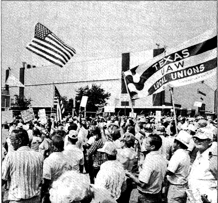
UAW Locals 848, 218 and 317 rally outside Vought plant.

NOTE: Detailed accounts of these situations have been published in Solidarity, the monthly magazine of the International UAW—June 1982, December 1983 and August 1985. For copies write Solidarity, UAW, 8000 E. Jefferson, Detroit, MI 48214.