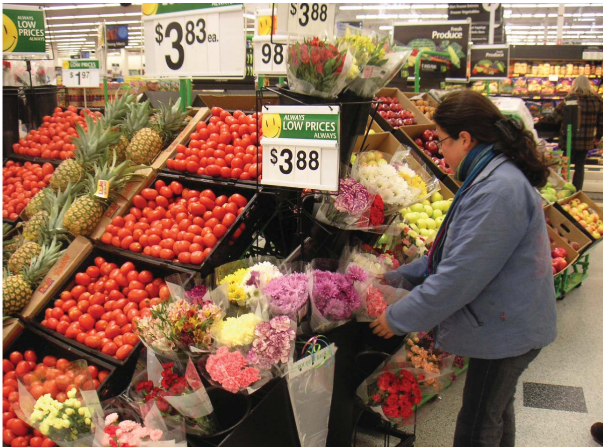
A flower worker visits a Wal-Mart in the United States, where flowers from Ecuador and Colombia are sold.