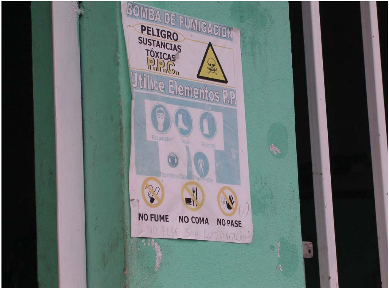
A sign warning of the dangers of the fumigation chemicals at Elite Flowers plantation.