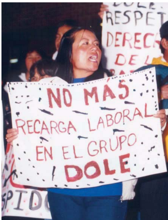
Workers protest Dole’s attacks on the worker-organized union.

A similar story is being told at Dole’s Flores de Fragancia Farm, but there is still an opportunity for the workers to prevail. Untrafragancia, the local independent union has been fighting for several years to negotiate a collective bargaining agreement, but Sintraflor, the Dole-friendly union, is Dole’s excuse to not acknowledge Untrafragancia. The union is hoping that the Colombian Ministry of Social Protection will grant an arbitration tribunal that could possibly include ILO observers to ensure a fair outcome. xxxiii