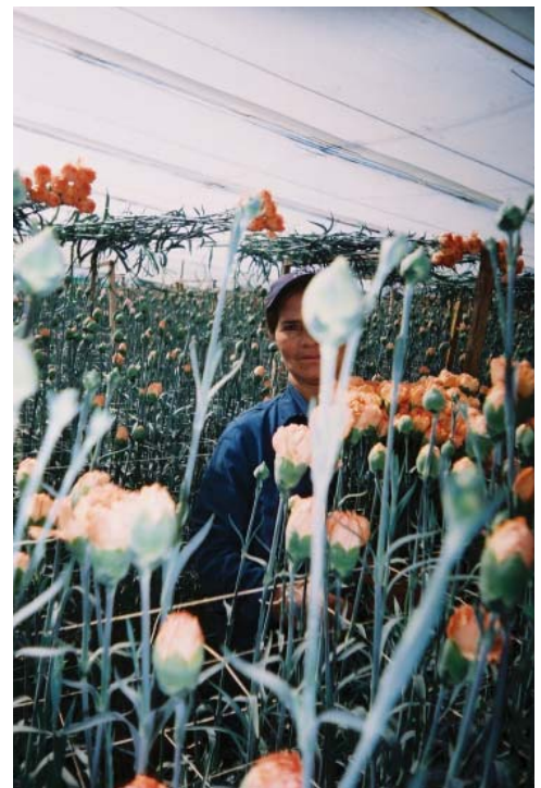
A worker in the field at a Colombian plantation.