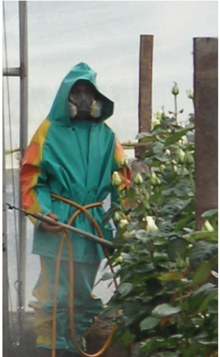
A worker spraying chemicals at a farm in Ecuador.

Genetically modified flowers raise even more questions about the effects of floriculture on human health and the environmental. In 2000, the first genetically modified flower, a blue rose, was approved by the Colombian flower industry. It contains genes derived from petunias to provide its artificial color. xxx Flower genes are now being altered genetically to make the flowers pest and disease-resistant, to increase the output of blooms and to make flowers last longer, but there is growing concern about the long-term effects of GMOs.