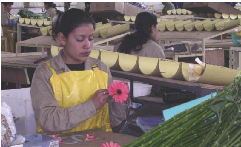
A female worker at Elite Flowers.

Sexual Violence: This is any act in which the person in power uses physical force, coercion, or psychological intimidation to force another person to participate in a sexual act against their will, or to participate in sexual interactions that lead to their victimization.