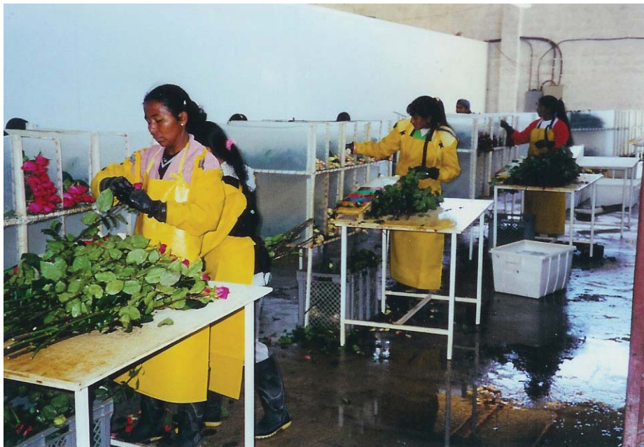
Flower workers at a plantation in Cayambe, Ecuador.