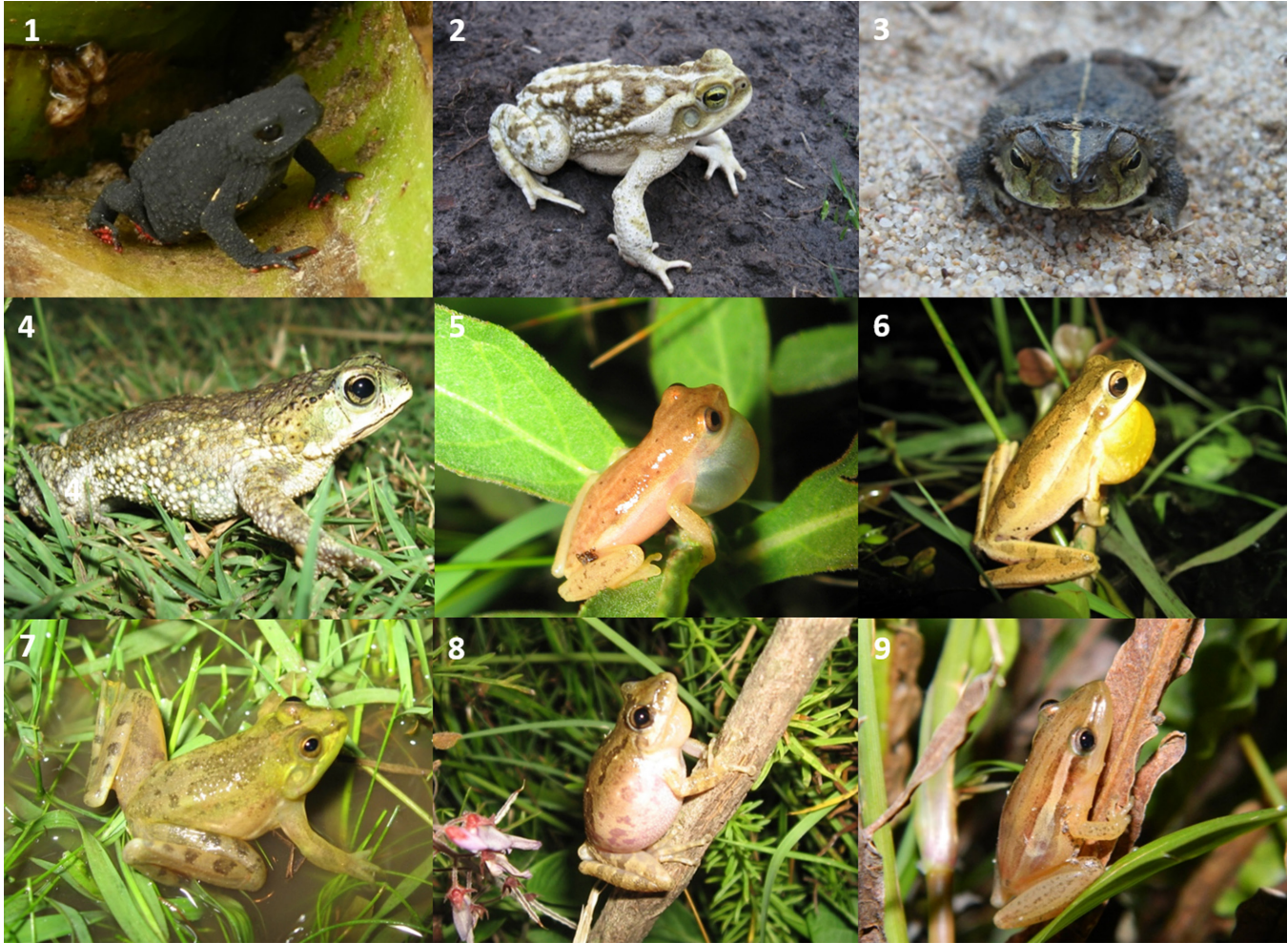
Figura 2. Especies encontradas durante el periodo de muestreo en Barra de la Laguna de Rocha: 1) Melanophryniscus montevidensis , 2) Rhinella arenarum , 3) Rhinella dorbignyi , 4) Rhinella fernandezae , 5) Dendropsophus sanborni , 6) Boana pulchella , 7) Pseudis minuta , 8) Scinax granulosus , 9) Scinax squalirostris .