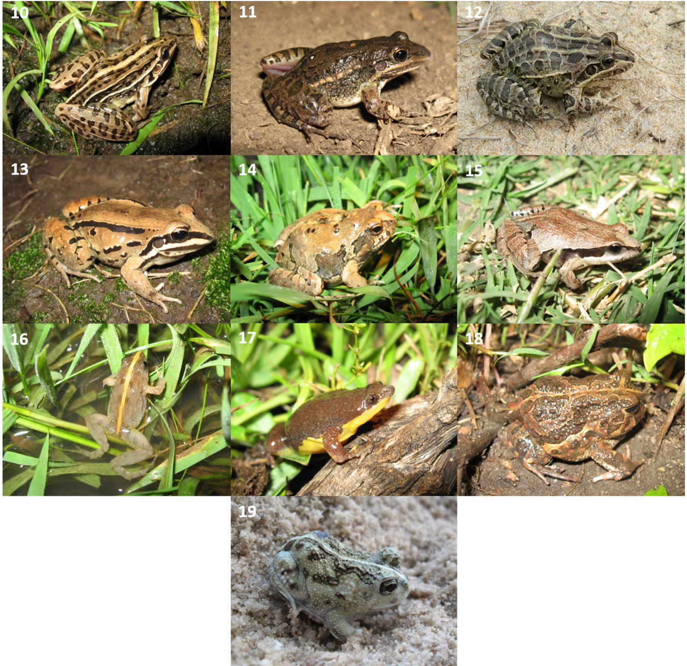
Figura 3. Especies encontradas durante el período de muestreo en Barra de la Laguna de Rocha: 10) Leptodactylus gracilis , 11) Leptodactylus latinasus , 12) Leptodactylus latrans , 13) Leptodactylus mystacinus , 14) Physalaemus biligonigerus , 15) Physalaemus gracilis , 16) Pseudopaludicola falcipes , 17) Elachistocleis bicolor , 18) Odontophrynus americanus , 19) Odontophrynus maisuma .