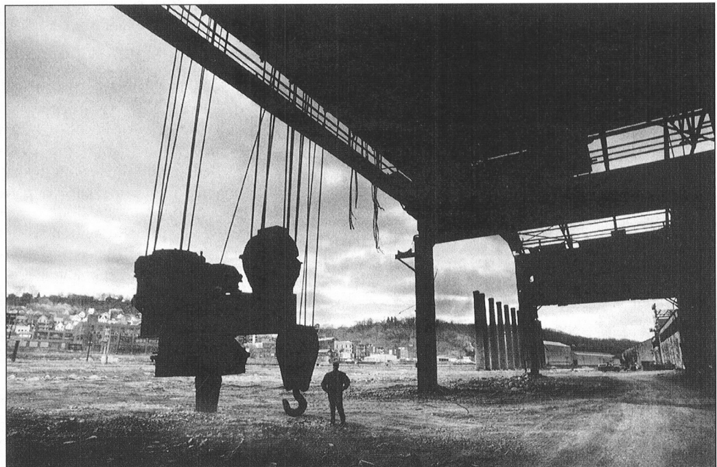
The closed steel plant in Homestead, Pennsylvania. Metal production is one the industries in which jobs continue to be shifted offshore from the United States.

In combination, the data emphasize that it is not a story of good jobs being stolen from U.S. workers by low-wage workers in Latin America and Asia, especially China, with whom U.S. workers can never hope to compete. Instead it is a story of the world's largest multinational corporations buying and selling companies and pieces of companies, opening and closing plants, downsizing and expanding operations, and shifting employment from one community to another, all around the world. ■