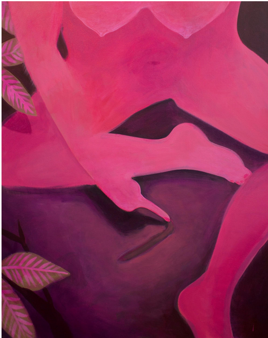
There in the Moistened Soil , 2016 Acrylic on Canvas, 30 x 30"

chest at the ground where I draw a line in the dirt or inspect the fossilized skeleton of a recent relative. This down-the-body perspective calls to mind the painter Joan Semmel, who between 1974 and 1979 made a body of paintings she refers to as self-images. While many of these self-images also include the downward view of a lover's body next to her own, others such as Me Without Mirrors offer a self-reflexive point of view similar to the self-reflexive view of the hominid woman in a quiet and contemplative moment.