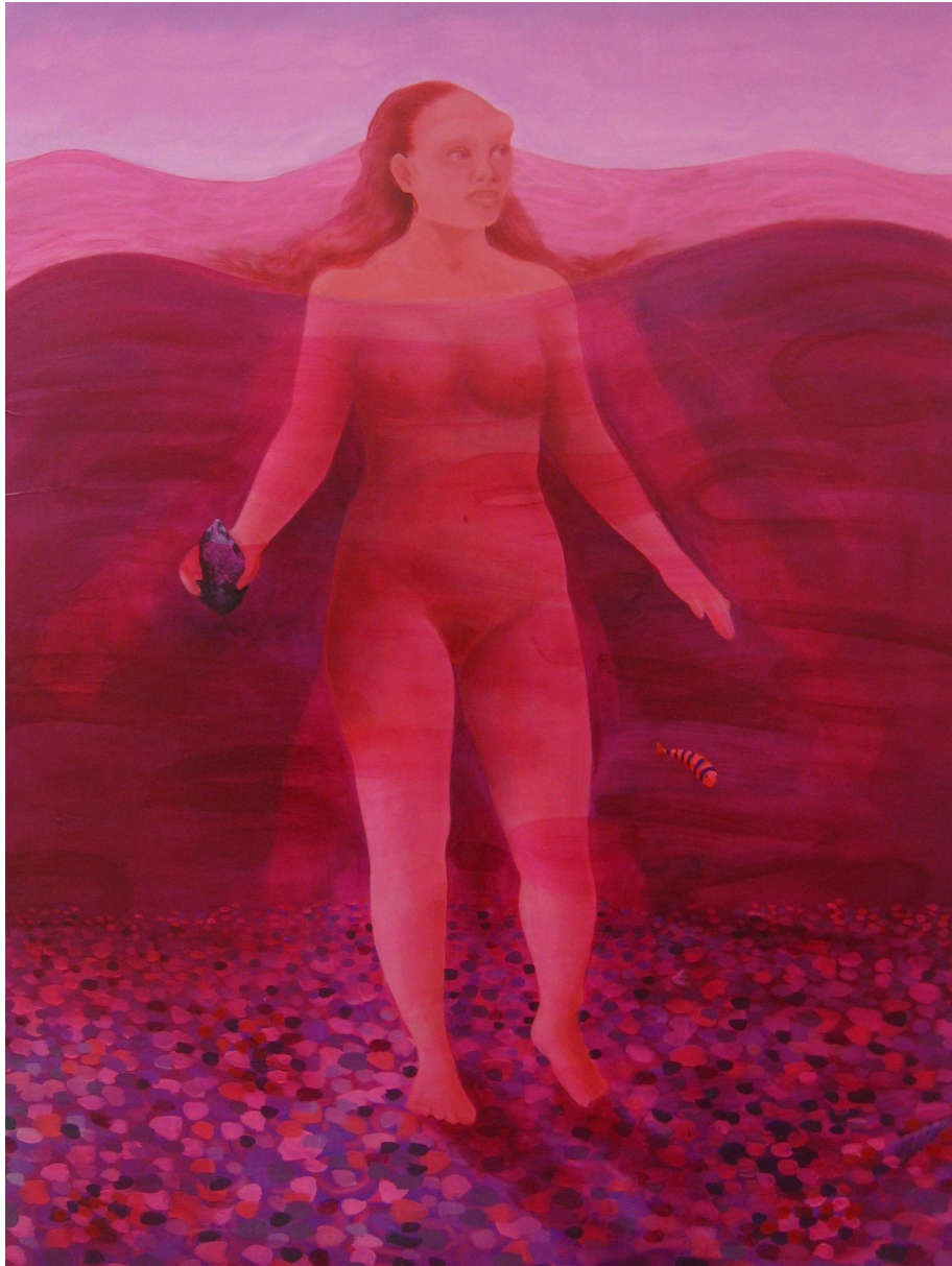
My Eyes Evolved Underwater , 2015 Acrylic on Canvas, 48 x 64"

forth. 12 This is a suiting example because beyond the parallel of pink and green (pink belly and green sargassum), dolphins are, in a sense, modern day aquatic apes. Mirroring apes in intelligence and social finesse, dolphins are perhaps what may have come had a certain semi-aquatic Australopithecine ancestor stayed in the water.