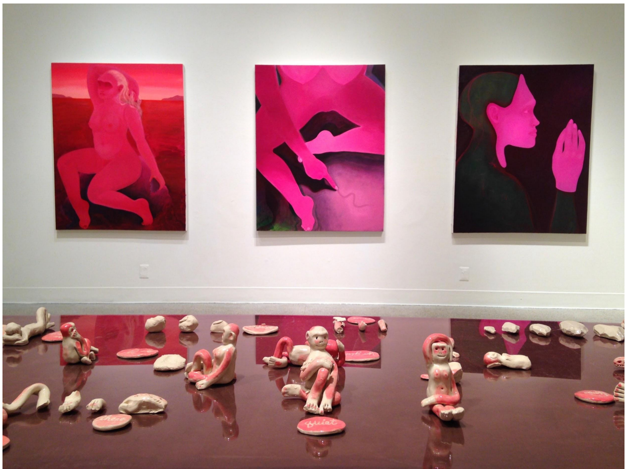
Installation View of Thesis Exhibition, 2016