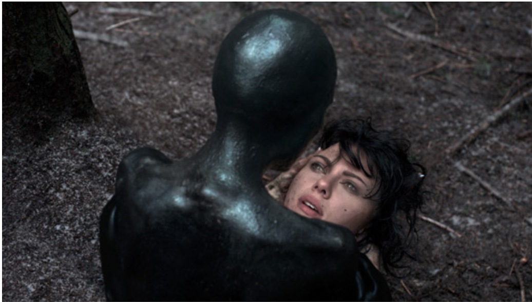
Still from Under the Skin , 2013

and ultimately the leaders in crossing that threshold into becoming modern humans, male robots in film are given intellectual pursuits rather than romantic pursuits, and in some cases do not even need a human body in order to evoke empathy. Take TARS from Interstellar or David from Prometheus , for example. One is a moving geometric form and the other takes the form of a male human, but both develop empathetic relationships with their human colleagues without any romantic feelings. Even Samantha from Her , who is completely body-less, is sexualized on the presumption that we know what Scarlett Johansson looks like, whereas HAL 9000 from 2001: A Space Odyssey never needed a physical representation that could be attached to his voice. 17