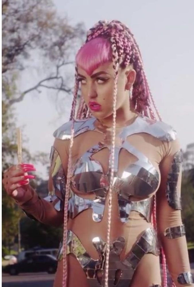
Still from Grimes' video Genesis , 2012

Besides captivating visuals, music videos also offer me useful content, or at the very least, a sense of empowerment from the (mostly female) artists whose videos I watch. FKA Twigs is an artist whose thoughtful music videos provide less of a visual sensation and more of an interest in the power dynamics she enacts. In the video Papi Pacify , Twigs is held against a man's chest, and his arms engulf and restrain her head and neck while he inserts his fingers into her mouth. Her own hands, adorned in decadent, jeweled nails, graze over his. In one section of the video play M3LL155X (pronounced "Melissa"), Twigs' head is imposed onto the body of a blow-up doll. She lies immobile but also receptive in the center of a bed as a man stands before her,