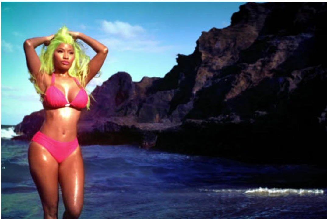
Still from Nicki Minaj's video Starships , 2012

eyeing her. He works himself up to an excessive level of arousal and has sex with her body, leaving it deflated when he is finished. This scene also mirrors scenes from the sci-fi thriller Under the Skin but with reversed roles. Instead of a leering male figure and the deflated skin of a female character as in Twigs' video, Under the Skin provides chilling scenes of a female figure, the Scarlett Johansson alien, who lures in male characters that unsuspectingly sink into a darkened void where their bodies are abruptly sucked away, leaving their empty skins floating in the darkness.