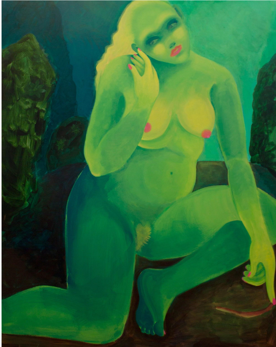
A Prehistoric Character Points, 2016 Acrylic on Canvas, 48 x 60"

The clay objects I make, on the other hand, are artifacts. Stylized figurines modeled after the hominid characters exist amongst fossil skulls, stone tools, and flat medallions with words and phrases inscribed onto them. The figurines are at once the objects made by my imagined hominid characters as well as characters of their own posed within their own compositions. This duality shifts around based on the other clay objects that accompany the figurines — next to a stone tool, also to the scale of an