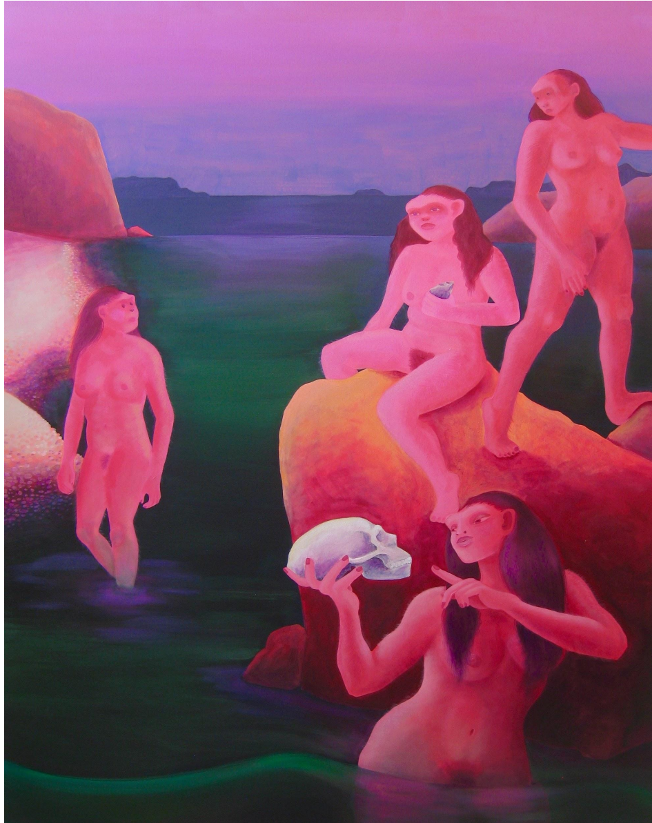
Bath of the Early Pleistocene Babes, 2015 Acrylic on Canvas, 58 x 74"

When the hominid characters are not presented within the direct gaze of the viewer, the perspective of the painting starts to take on the hominid's view. Now, instead of existing within a leisurely timeframe, the viewer is placed within the moments of discovery. And, rather than painting a posed hominid woman through the internalized gaze of her viewer, I can start to embody the hominid woman herself, looking down my