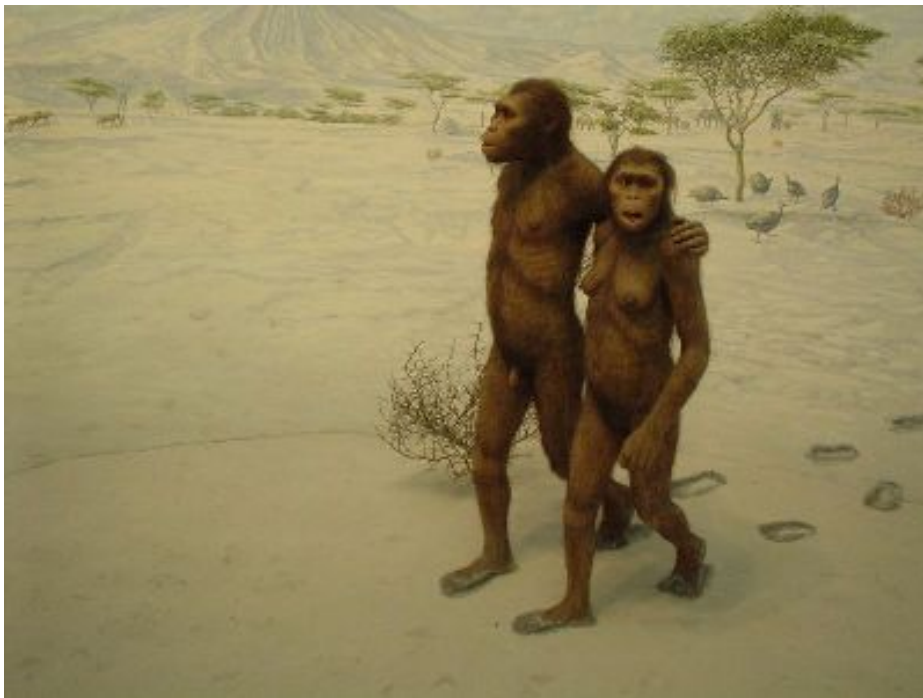
Reconstruction of Laetoli Footprints featuring Australopithecus Afarensis couple