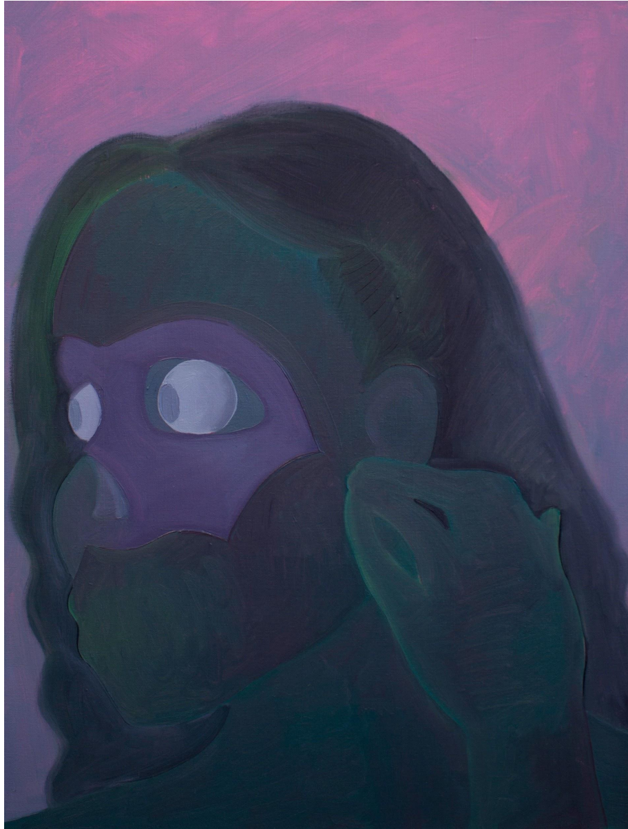
What Happens When I Turn Around and Tell You I'm Real , 2016 Oil on Canvas, 18 x 24"

on as a character encompassing the hominid, the human, the robot, and anything in between.