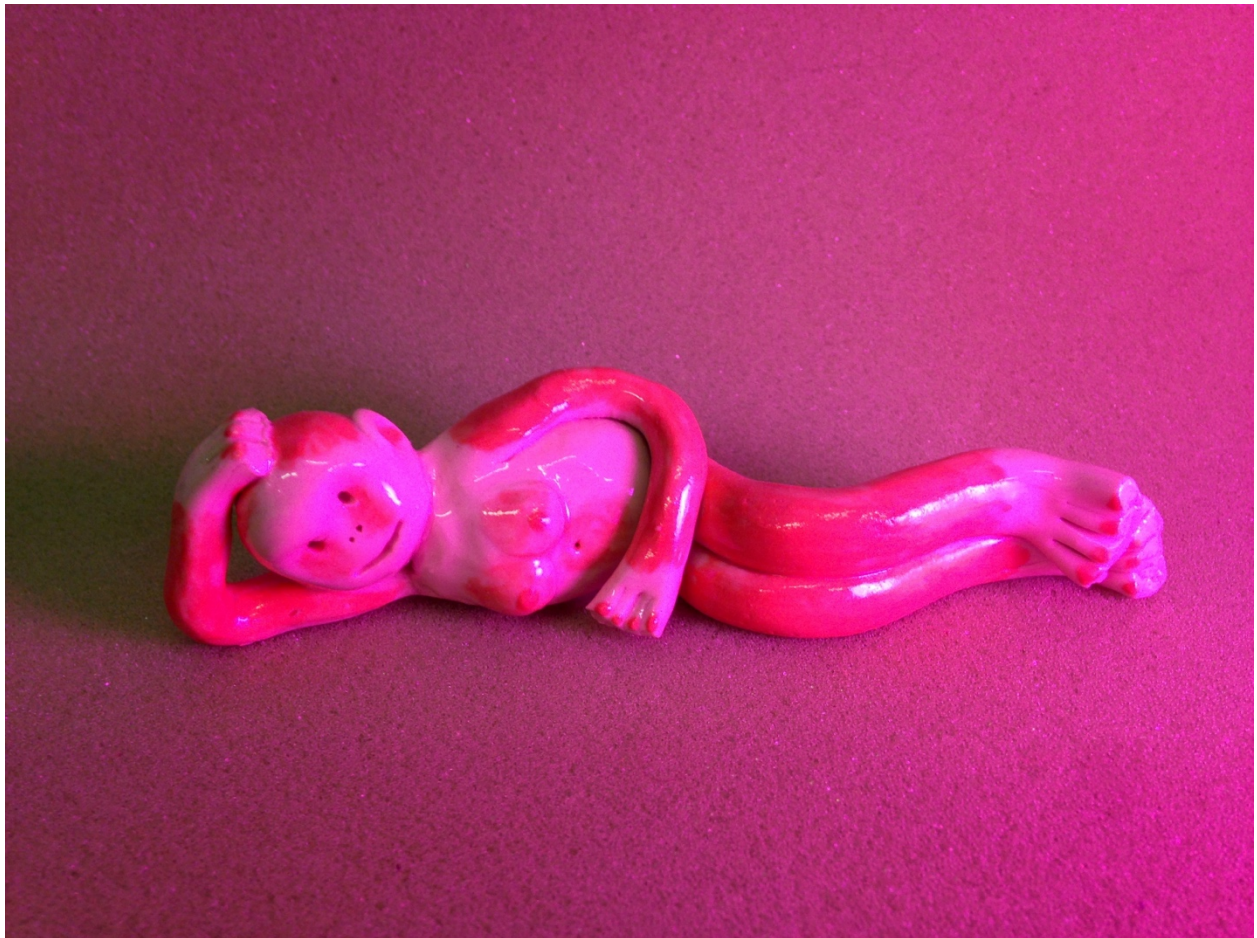
Digital photograph of ceramic figure with filtered light, 2016

She is the goddess technium, who in her leisurely time adorns her body in power and desire.