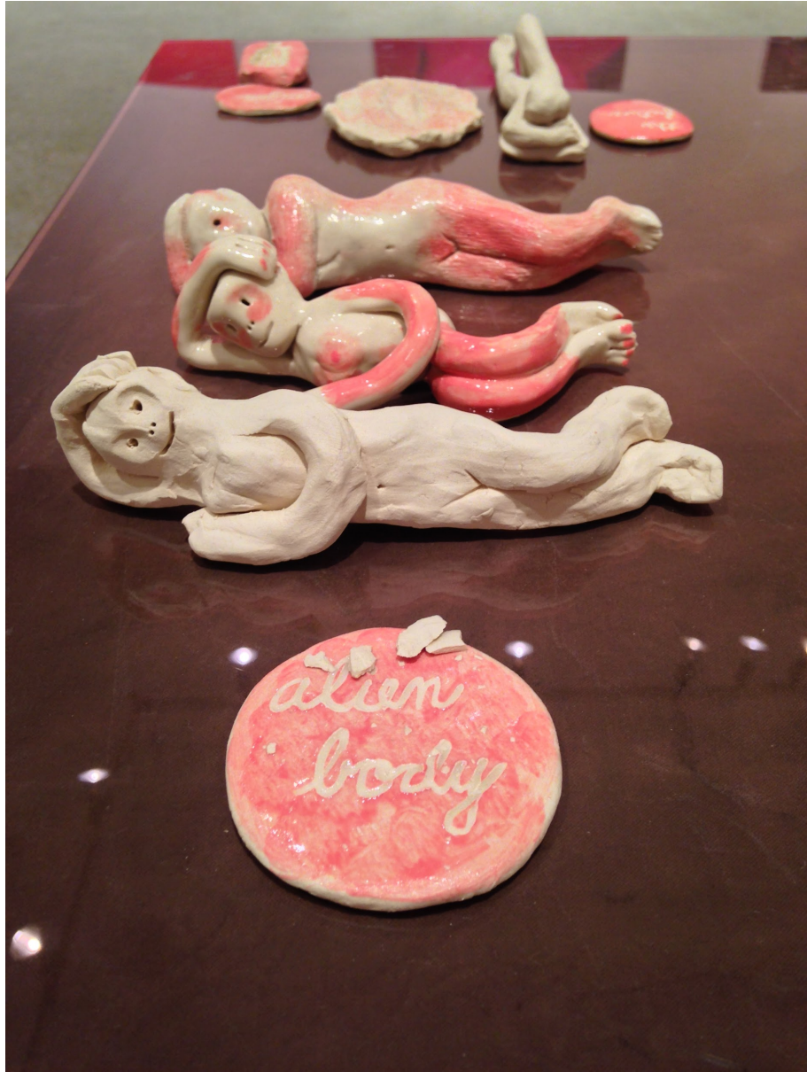
Detail from How I Learned About the World , 2016 Fired and Glazed Ceramic, Wood, Fabric, Plexiglass, and Acrylic, 24 x 48 x 37"