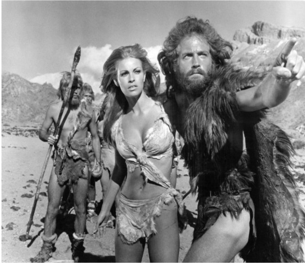
Still from One Million Years BC , 1966