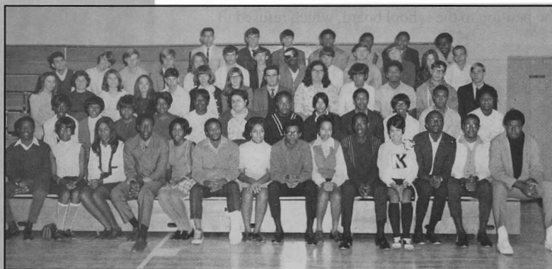
Senior class, New Kent High School Yearbook, 1970.

Supreme Court Justice William H. Rehnquist later referred to the Green case (in 1972) as a "drastic extension of Brown ." The case, though based in New Kent County, affected school systems throughout the nation. It was in Green v. County School Board