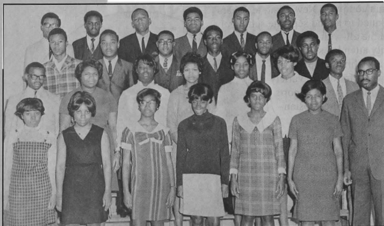
George W. Watkins School Yearbook, 1969. This photograph was taken after the Green decision and before combining the two schools as one high school.

After their loss in the Fourth Circuit Court of Appeals, the NAACP chose to take the Green case to the U.S. Supreme Court. In October 1967 NAACP attorneys argued that the county school board's "freedom-of-choice" plan illegally placed the burden of integrating the county's schools on blacks themselves. They also argued that the county sought to maintain a segregated school system by bussing some black students up to 20 miles to the all-black George W. Watkins School, though the predominantly white New Kent School was much closer to their homes.