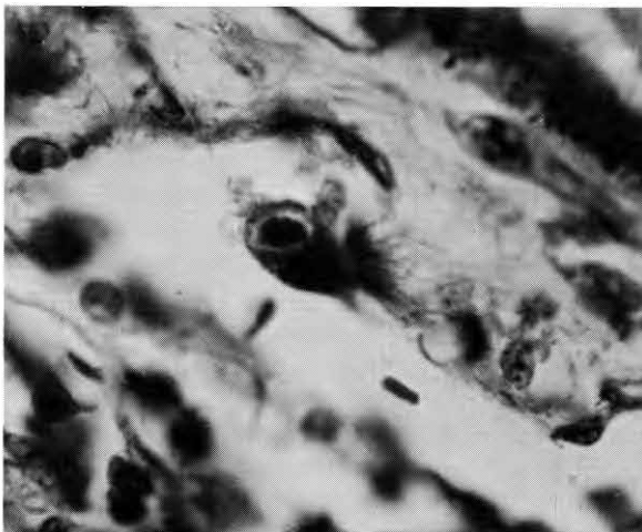
Fig. 2—Intranuclear inclusion with prominent halo in swollen endothelial cell (H&E 500 \times ).

equivocal inclusion bodies. However, there were typical basophilic inclusions surrounded by a halo in swollen endothelial cells of the choroid (figs. 1 and 2). Many smaller basophilic inclusions were seen in the cytoplasm of the endothelial cells. In a few areas the necrosis extended into the retina between the outer plexiform and inner nuclear layers, and in some they involved the entire thickness of the retina. The optic nerve contained many similar areas of necrosis, but the optic nerve head was uninvolved (fig. 3).