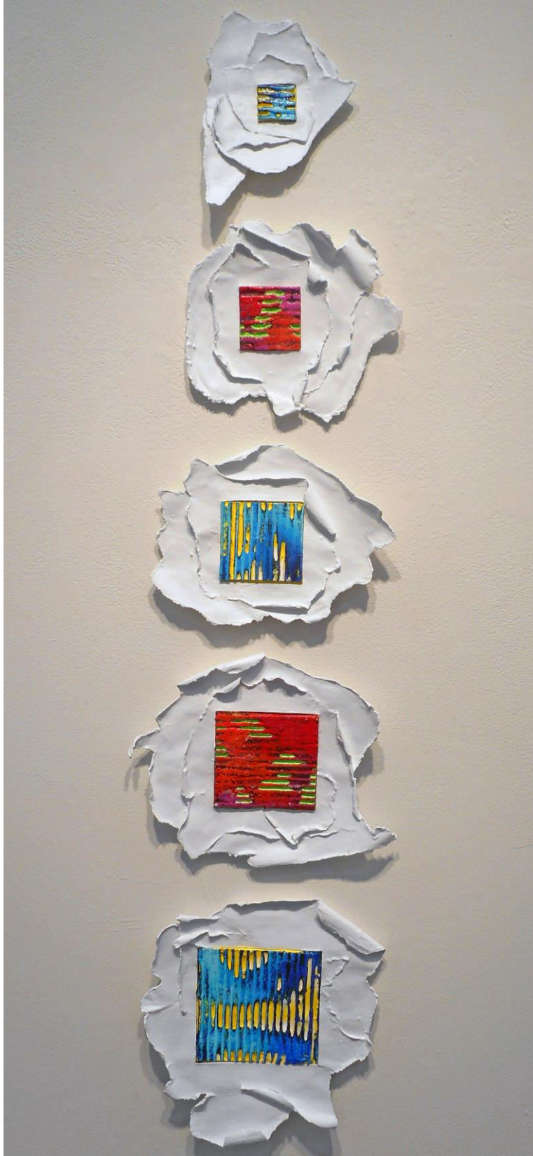
Figure 6. Untitled #5 , acrylic, cardboard, paper, 54" x 16" x 2", 2013.