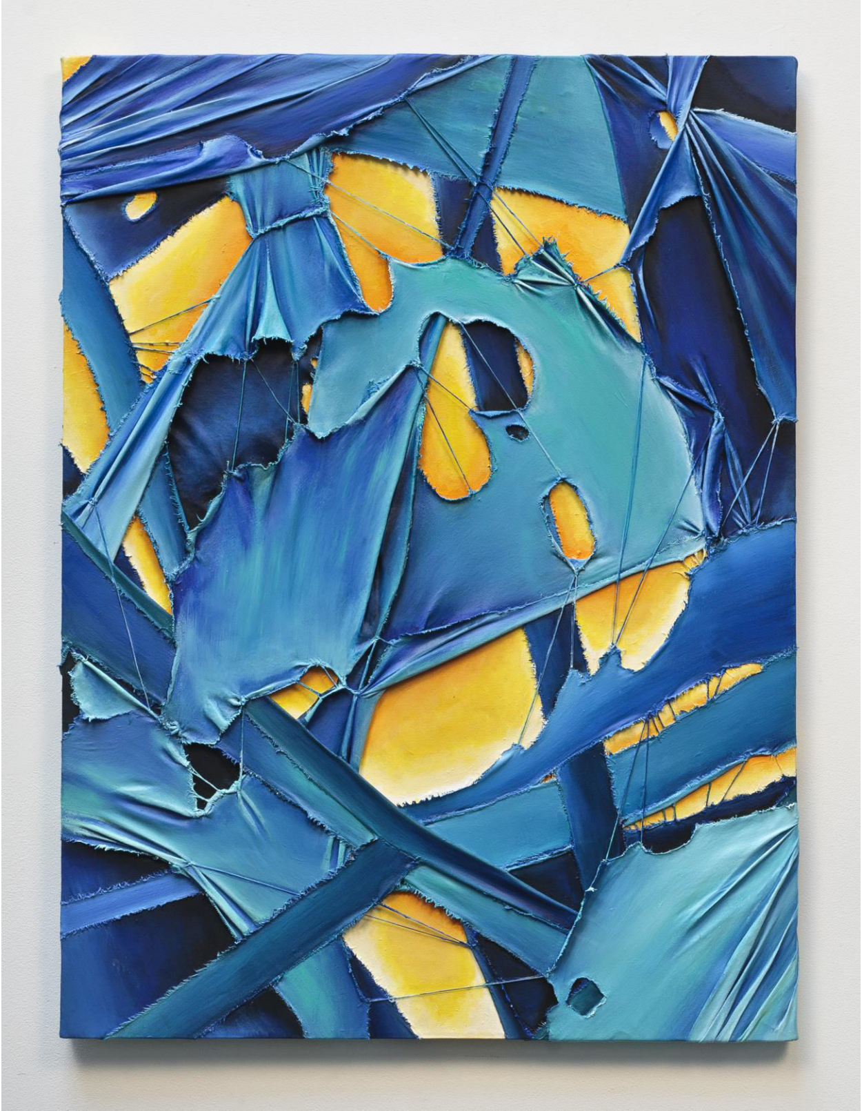
Figure 1. Untitled #2 , acrylic, canvas, thread, 30"x 30" x 1 3/4", 2011.