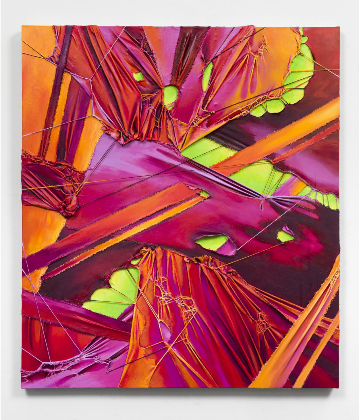
Figure 3. Untitled #3 , acrylic, canvas, thread, 48"x 42" x 2.5", 2014.