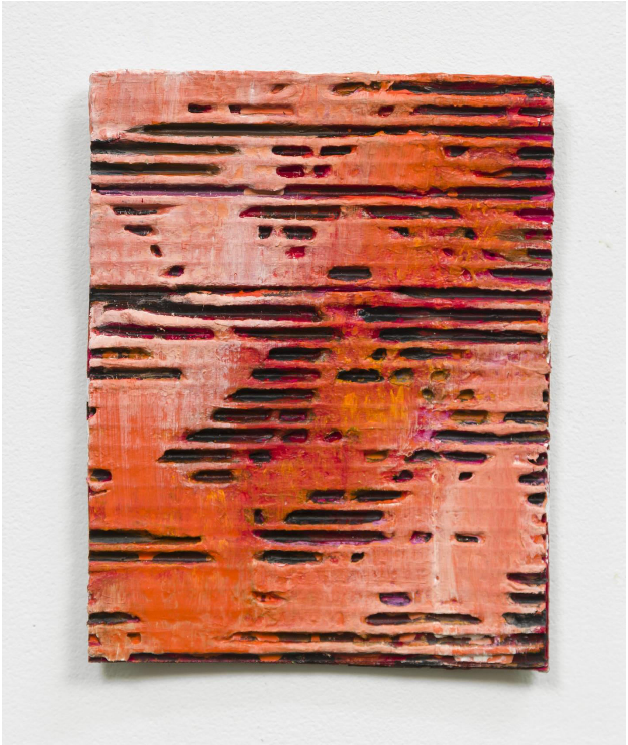
Figure 4. Untitled #3 , acrylic cardboard, 12"x 9", 2011.