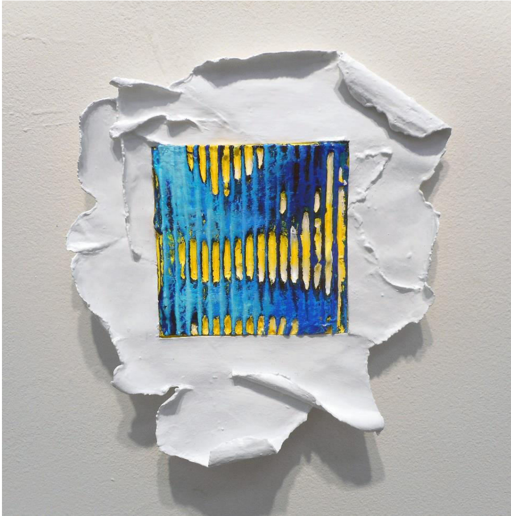
Figure 7. Untitled #5 , (detail), acrylic, cardboard, paper, 12" x 10" x 2", 2015.