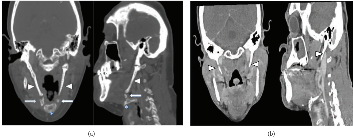
FIGURE 1: (a) CT scan of hyoid bone-styloid process extension. CT scan of hyoid bone and styloid process in patient. Arrowhead points to styloid process. Asterisk marks hyoid bone body. Thick arrow points to area of extension between hyoid bone and styloid process. (b) Normal CT scan of styloid process and hyoid bone. Normal CT scan of hyoid bone and styloid process for comparison. Arrowhead points to styloid process. Asterisk marks hyoid bone body.

chemoradiotherapy alone is sufficient [8]. During the procedure, the upper boundary of the hyoid bone is identified to facilitate the detachment of the suprahyoid musculature. The hyoid bone also serves as a point of reference to identify and preserve hypoglossal nerve. Potential anatomical variations in this bone should be appreciated prior to most surgical approaches to the larynx, as was encountered in this case.