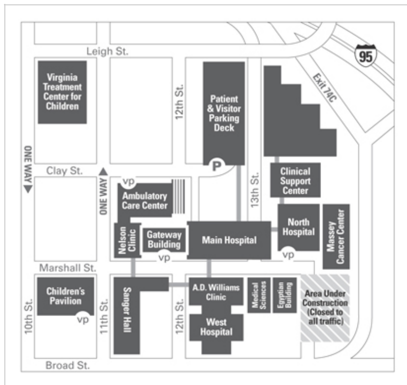
vp Valet Parking P General Parking