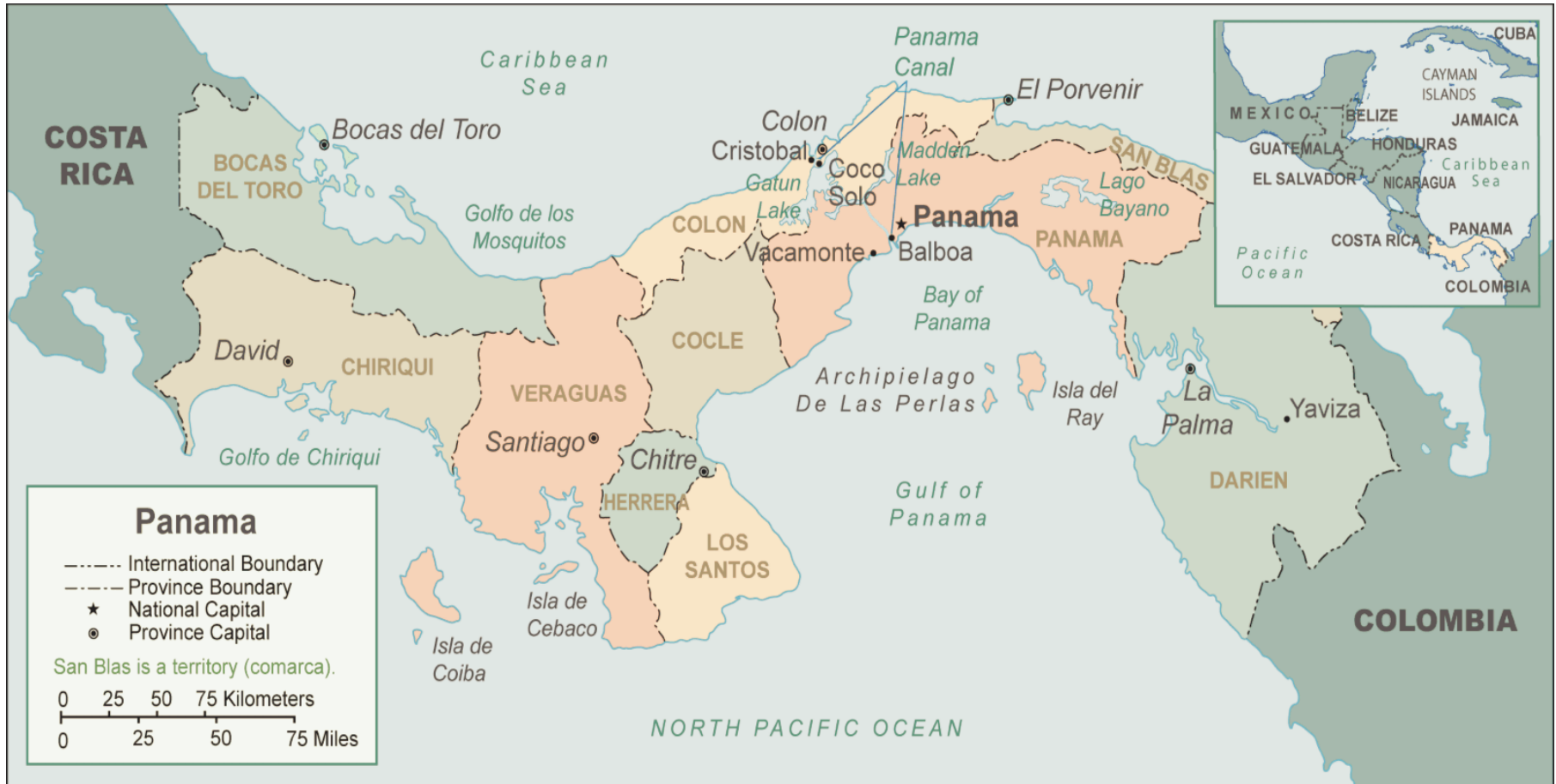
Figure 1. Map of Panama