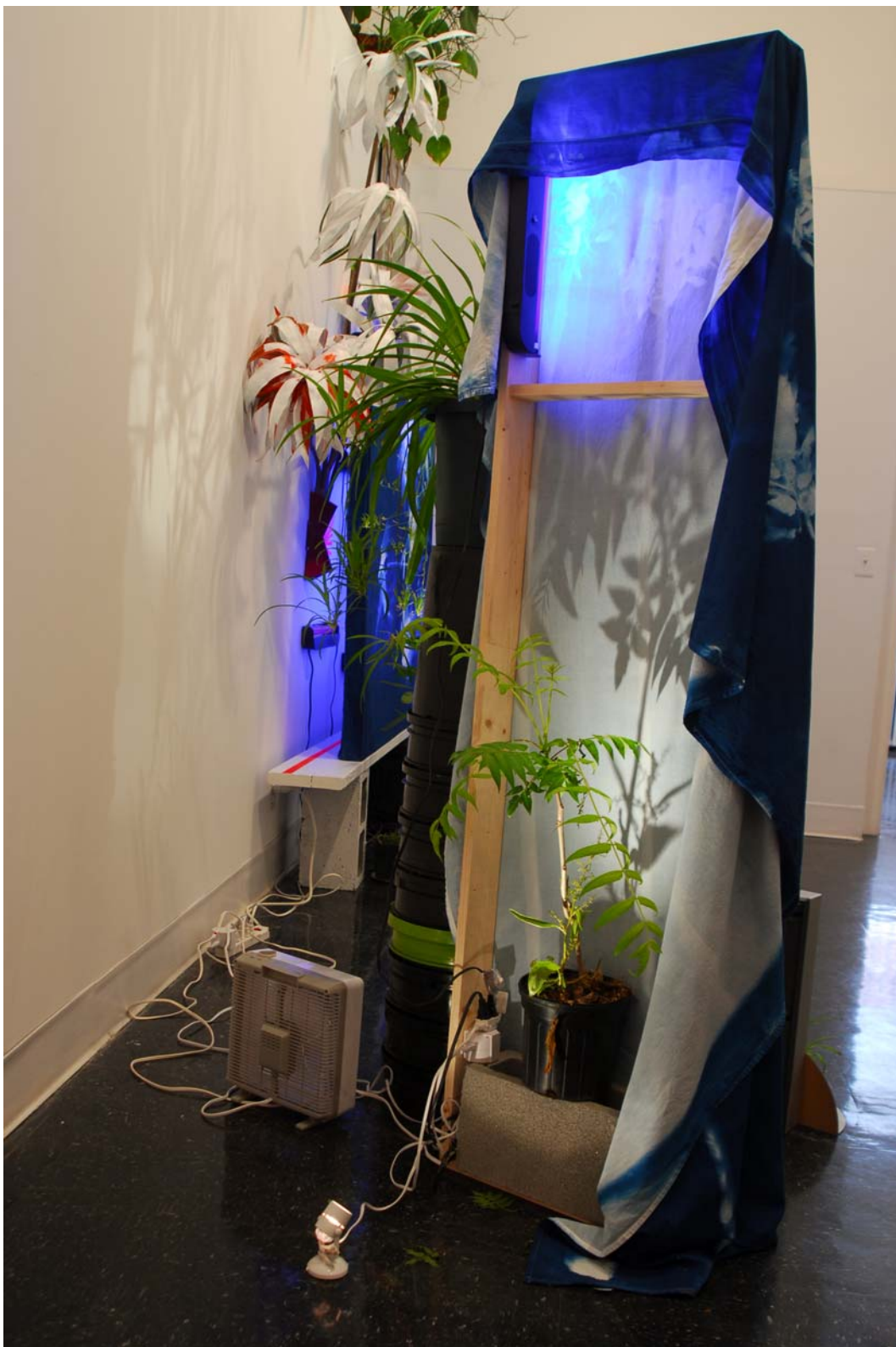
most constant hot lover, view from the rear