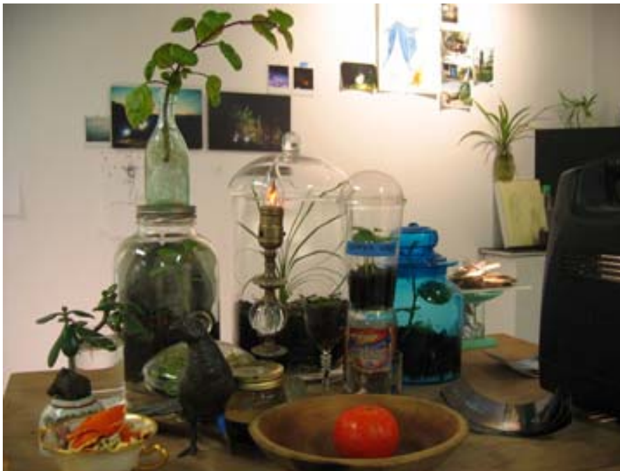
scenario , mixed media installation, 2006

Each piece is site-specific, in that it never moves in its exact form to another space. It may retain its core, but loses parts, and picks up others on its travels. The white gallery space gives the works a context; no, this is not my studio, this tire planter is not on the street, it is elevated, while laughing at itself, by coming into the gallery.