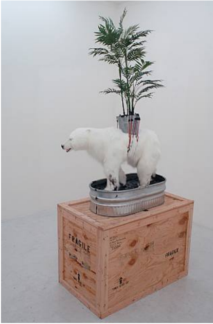
Mark Dion, Iceberg and Palm Trees , 2007

Joseph Beuys straddles the active and mystical stances of considering nature and the landscape. He is overtly active in his work ‘7000 Oaks’ in which he organized the planting of seven thousand trees in Kassel, Germany. In the work “Coyote; I like America and America likes Me”, he lived in the gallery for three days with a coyote (an endangered species at the time and an animal considered sacred to American Indians). It seems he was speaking simultaneously of the beauty and godliness of the animal, and of the American landscape and American Indians devoured by the formation and ‘progress’ of the United States of America. The drawings and sculptural work of Kiki Smith looks at the molecular make up of, and the whole cosmos, blood and stars, to contemplate the phenomenal intricacy that makes up the everyday. Her work speaks of astonishment.