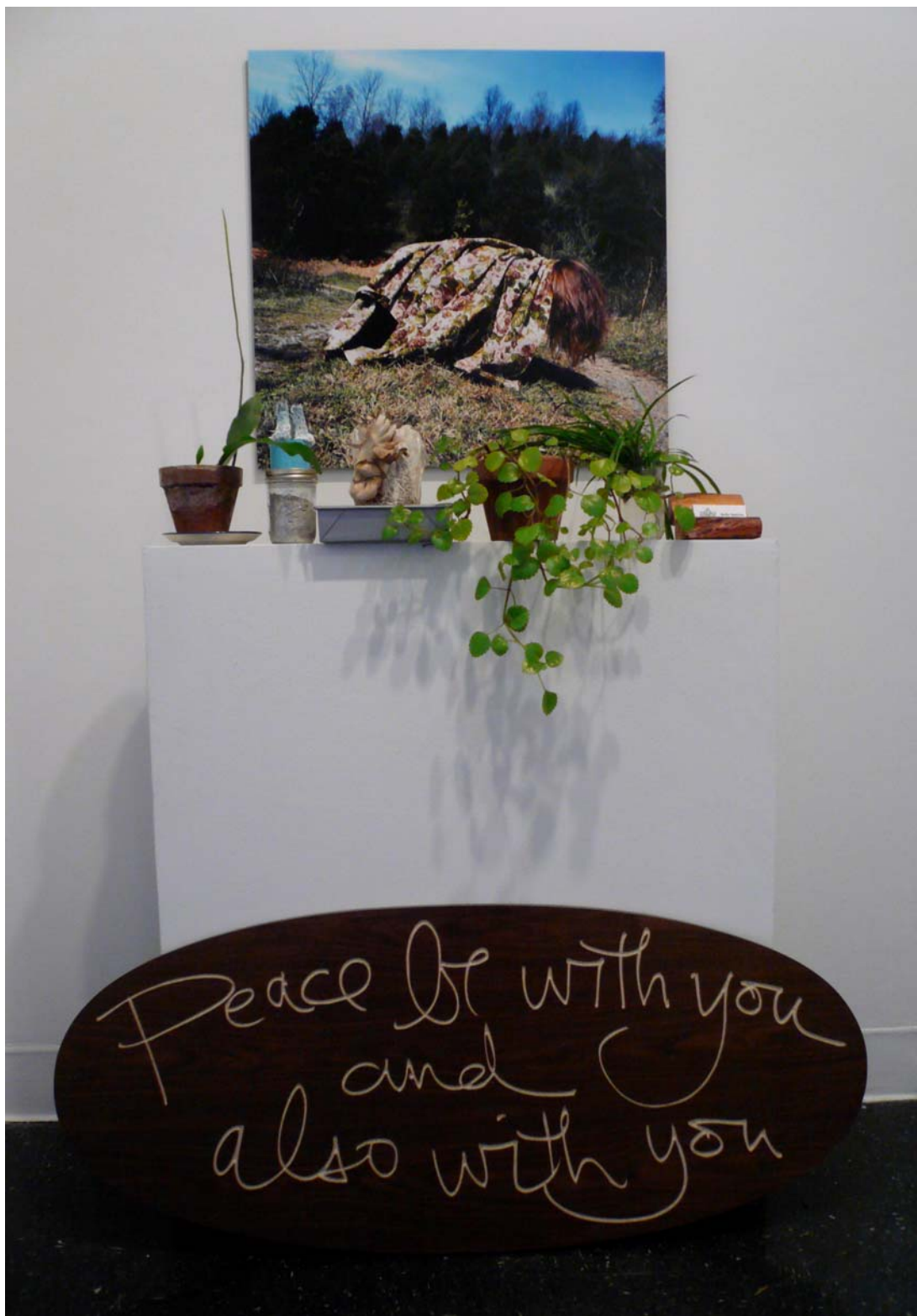
peace be with you