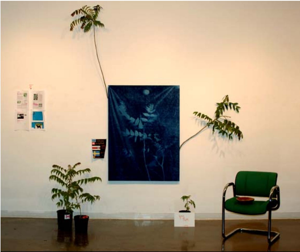
ghetto palm, your mom, call her, 2006

As a collaborator with nature, I navigate my way in the world through plants; observing, hunting for, collecting, classifying, cultivating, collaborating with, lobbying for, and eating them. The springtime resurrection of the plants mentally and physically sends me into the throes of love. I am giddy and high, and I am physically turned on. I believe in the psychological benefits the color green can give people, along side, of course, the necessary sustaining element of oxygen produced by the plants. My artwork aims to showcase these components, to be lighthearted, buoyant and stunning, without