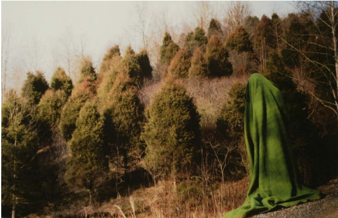
I join the army of the trees, 2006

“The rise of environmentalism, born in the US with Thoreau and raised by Muir, came to a kind of proactive maturity in the 1960’s. Between Rachel Carson’s ecological call to arms, Silent Spring , published in 1962, and the first Earth Day in 1970, environmental consciousness forever changed. The development of Land Art in many ways mirrored the post-war evolution of eco-thought. The early wilderness colonizing efforts of the first generation American Land Artists actually paralleled the ideas of conquest and exploitation that characterized the industrial era. At the same time many artists experienced a nostalgia for a pre-industrial Eden, which precipitated, first, a critique of these conditions and, ultimately, a proactive stance in which the individual began to feel empowered in the problems that had been identified. The great earthmovers who worked to forcibly rearrange the stuff of the natural world in an effort mediate our sensory relationship with the landscape were succeeded by artists who sought to change our emotional and spiritual relationship with it. They, in turn, spawned a third approach, that of the literally ‘environmental’ artist, a practice which turned back to the terrain, but this time with an activity meant to remedy damage rather than poeticize it.” (Jeffrey Castner) 12