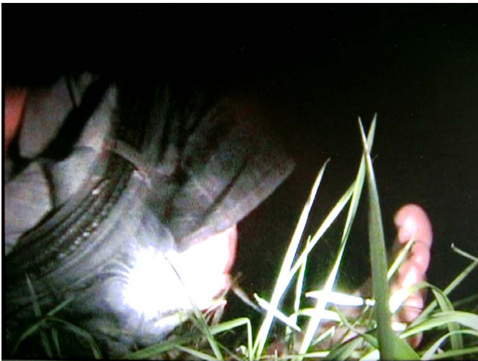
the feet, film stills