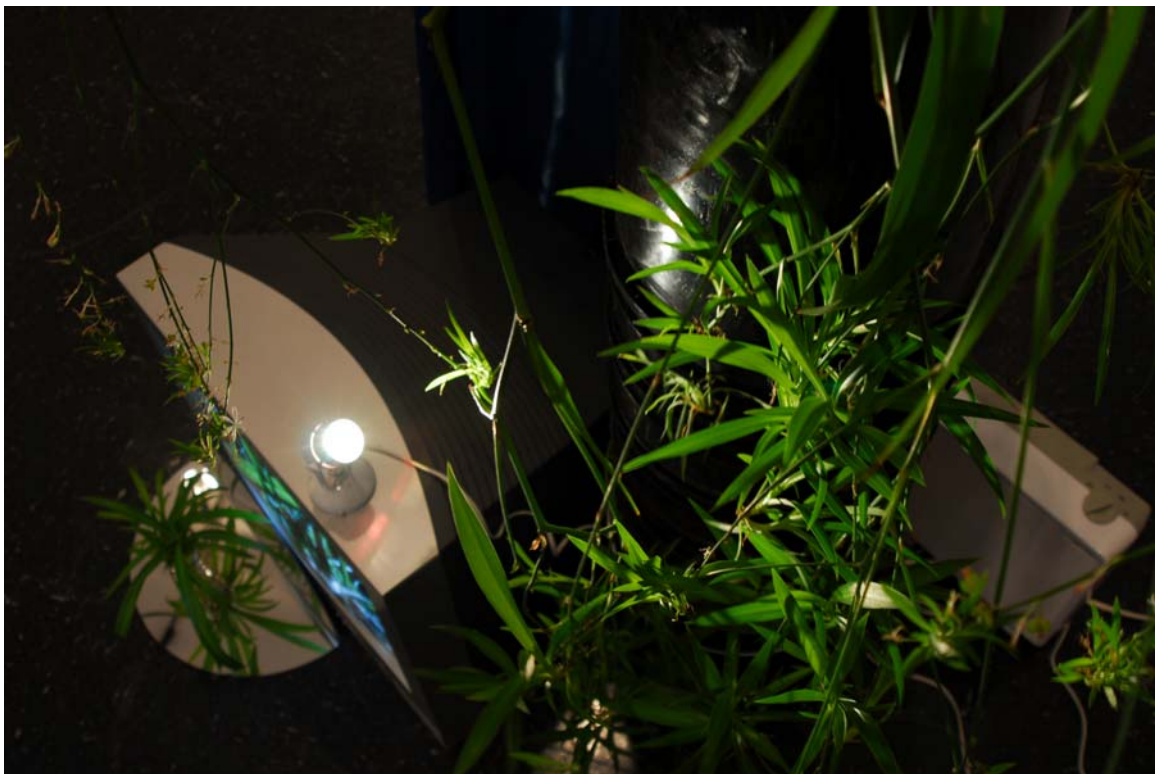
most constant hot lover, details