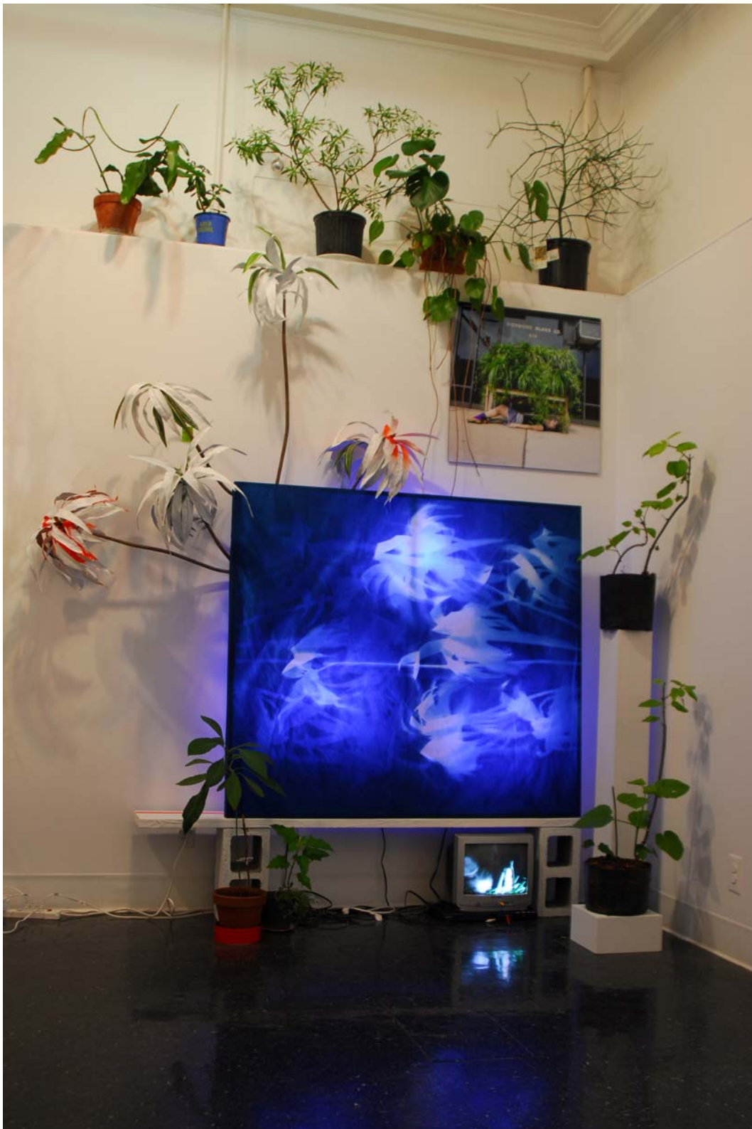
toward a new kinship constellation