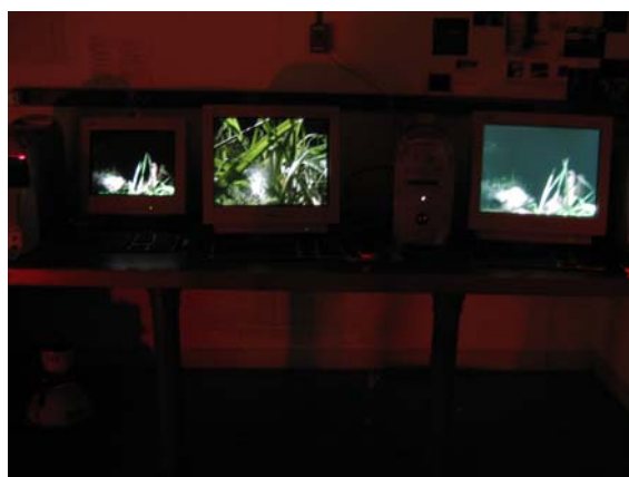
laying in bed with fellow MFA candidates, 2006