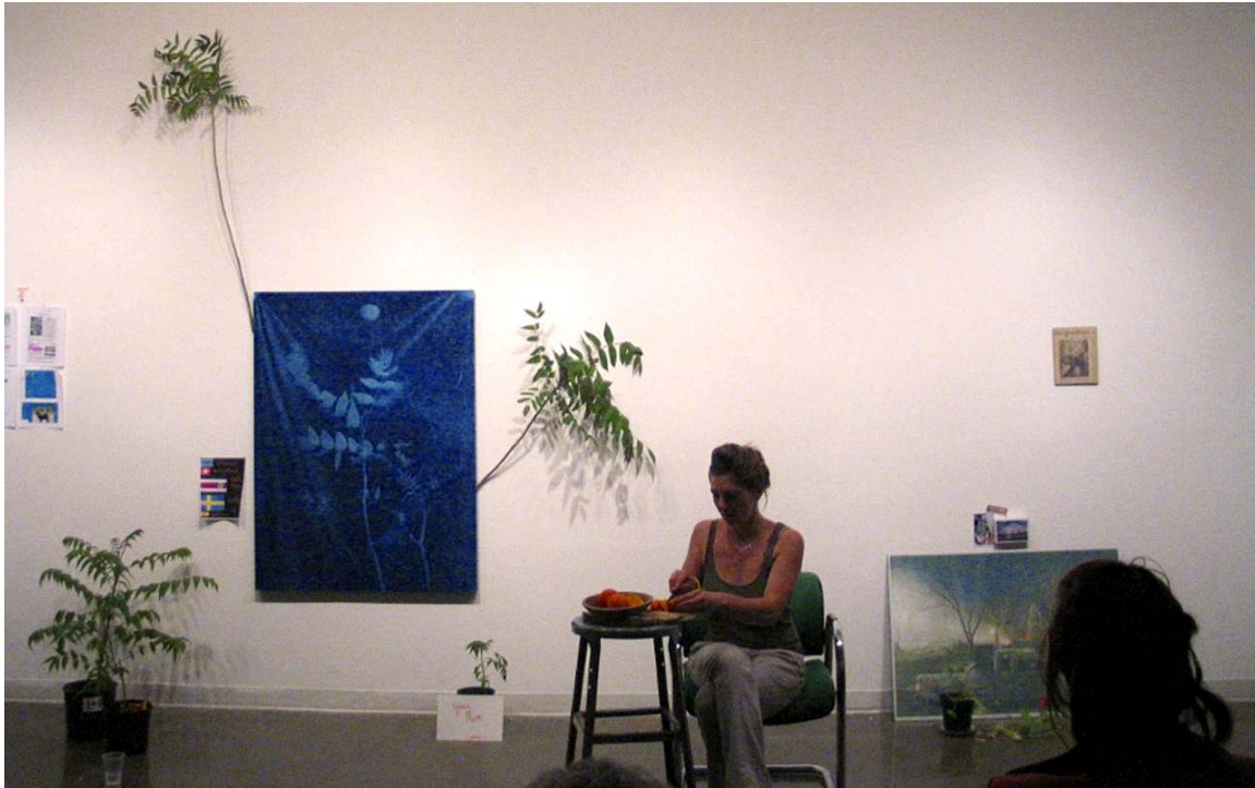
serving oranges during an art presentation

At other times I served tea or oranges along with the installations as a gesture of thanks to the viewer and in the hopes of facilitating conversation and community. I found amongst small groups of folks, the conversations flowed, people felt at ease and able to 'be there together'.