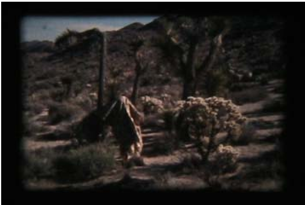
i am Joshua Tree , film stills