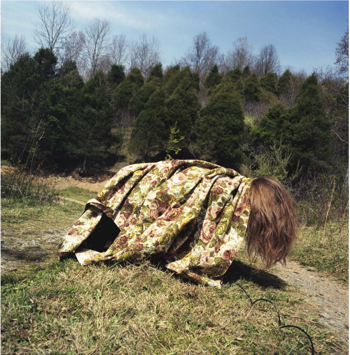
the new habit , 2007

forming on a sponge, or a simple houseplant in the midst of its photosynthesis (see peace be with you ).