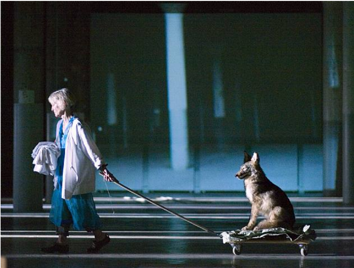
Joan Jonas, The Shape, the Scent, the Feel of Things , 2005

The works of Joan Jonas relate to my work in their non-linear storytelling and her use of the character, or the body confabulating with the earth. Along with vernacular mystical animals, like dogs, she benevolently colonizes the landscape, where each is the muse of the other. In her films made outdoors she establishes new countries, where fantasy and whim are encouraged. She displays her work in a cacophony of elements including performance, dance, film, projections, objects, drawing, sound and whatever else she may feel is important to coalesce the feel of the particular piece.