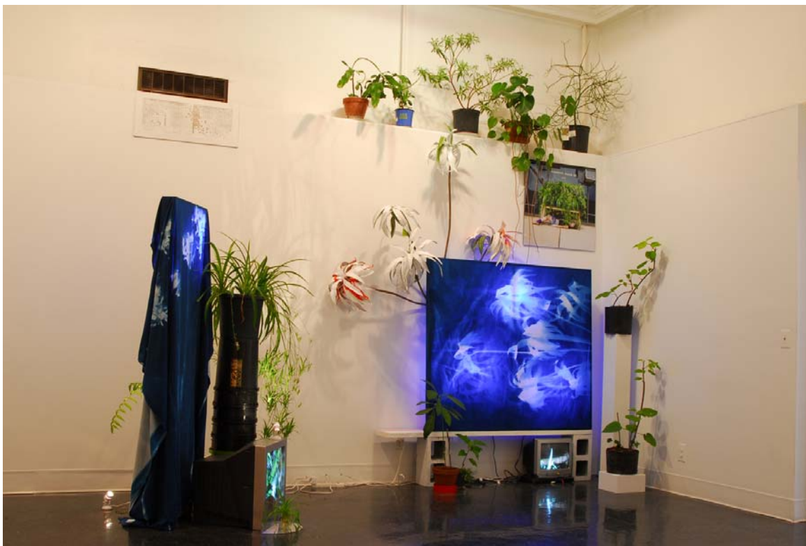
toward a new kinship constellation