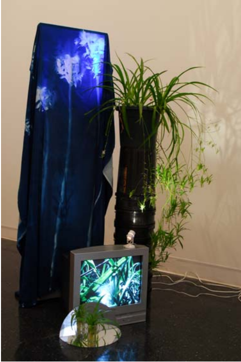
most constant hot lover , 2007

It has been pointed out that my work most constant hot lover works under the of the site/non-site philosophy, in its presentation of both the actual object and representations of the object. The real and the mediated reverberate with one another.