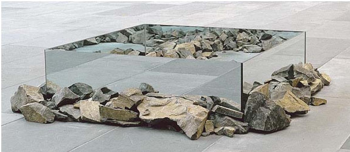
Robert Smithson, Rocks and mirror square II , 1971

During the sixties the landscape of the gallery itself came under the artists’ scrutiny. The artists of the Land and Earth works movement sought a new venue, the actual landscape, or as Robert Smithson coined, the ‘site’, and location and medium intermingled. Smithson felt he and his colleagues’ works had less to do with ideas of nature, rather that by a site being the work, or relocating elements of the site into the gallery in what he called ‘non-site’ works, that they were bringing up “not only specific overlooked locations, but also a conceptual relation between viewers and boundaries, inside and outside, center and periphery.” 10