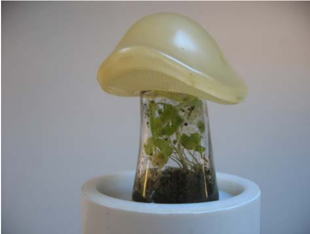
shroom terrarium , detail from scenario , jar and clover, 3 inches, 2006