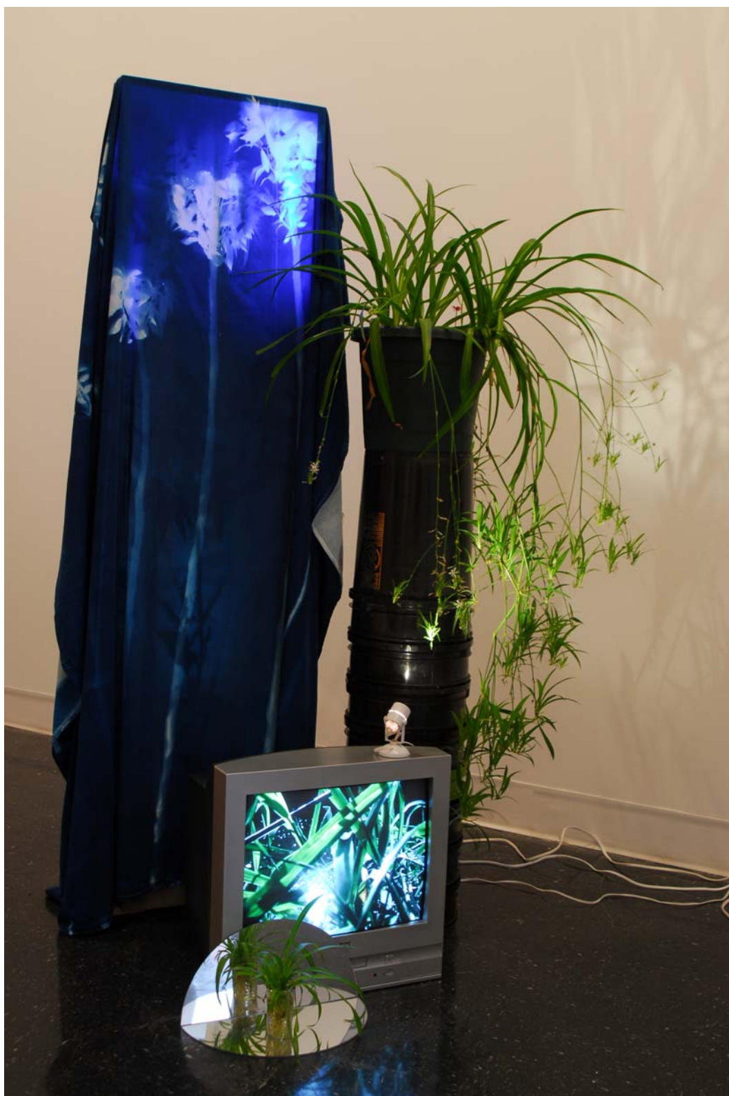
most constant hot lover