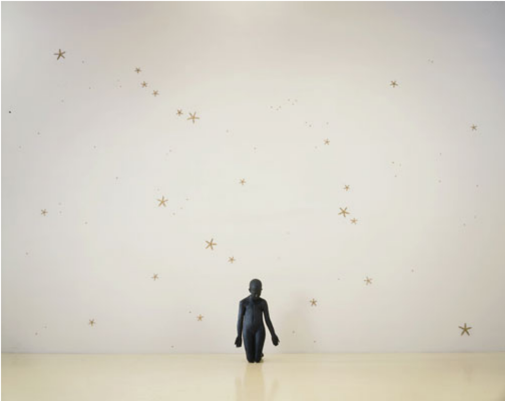
Kiki Smith, Blue Girl , 1998

Art can function in society as a way to interpret and understand the world. Some artists approach the subject of the land with an activist stance while others may utilize the powers of inference and dreaming to arouse the viewer. The subject of nature and the environment is pervasive in the arts, but rather than this fact making my own projects feel diminutive or derivative, it makes me feel part of a constellation of thinkers and practitioners with interrelated passions.