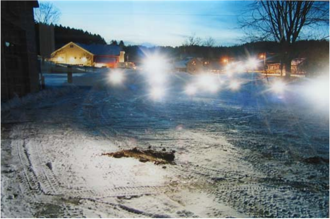
hovering constellation, 2005