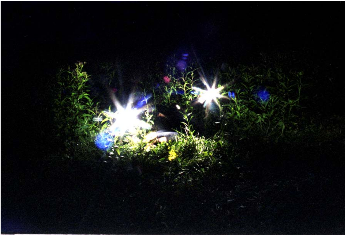
nocturnal garden, 2006

We see another attempt to join the landscape in the super 8 film i am Joshua Tree . A character dressed in a safety orange jump suit walks through the desert, as the picturesque journey continues, the protagonist's gait quickens. He/she finds themselves in a certain grove of Joshua Trees, and proceeds to blend into the landscape by covering them self with a floral drapery of the exact palette of the desert.