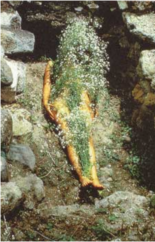
Ana Mendieta, Imagen de Yagul , 1973

One sees a relationship between my work and Mendieta's in that it is a record of a communing, collaborating, and a search for small epiphanies on sacred ground (see the new habit and urban survival techniques ). In the photograph nocturnal garden , glimpses of a body are seen in the lit up greenness of the plants as if by hovering stars surrounded by a black night. The photo is the record of this love affair, this rolling among the plants in the nighttime garden.