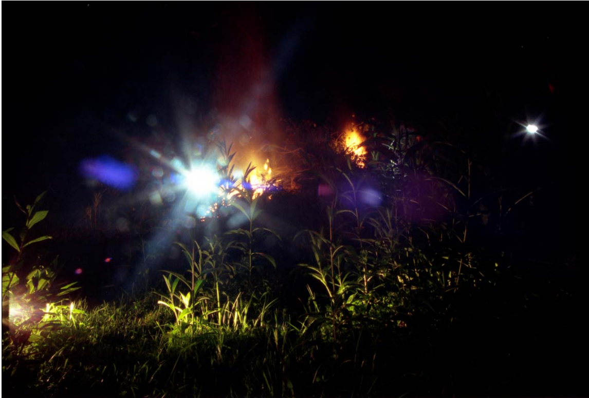
visitation , 2006

The ritual becomes to document these acts of relating to nature and the earth, to make images of the “joyful effort”. As nuns lay prostrate to God, I lay prostrate to mystery and nature, even if it is a new millennium post-nature nature. As in Zen meditation when a practitioner sits, then paces, sits then paces; I advance the film, perform the action of communing with the earth, advance the film, and perform the action again. From these acts a single photograph is chosen to represent.