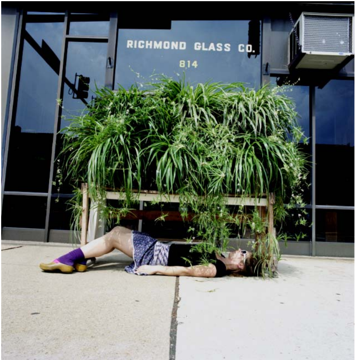
urban survival techniques, 2007