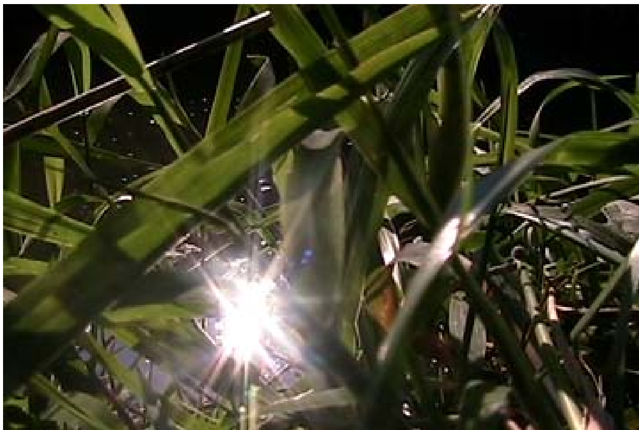
riverstars , film still