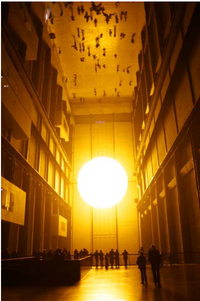
Olafur Eliasson, The Weather Project , 2003

Experiential: When Tikrit Tiravanija cooks a meal for people to eat together in a gallery or on site, we commune, and are reminded of the importance of community, of conversation, of eating, of the nutrition of the food that sustains us, and where it came from. Olafur Eliasson's "Weather Project" fabricated a huge indoor glowing sunset, supplemented with mists, for people to congregate and watch together. It raises the question; do we now need a media presentation and a museum to show us the sunset?