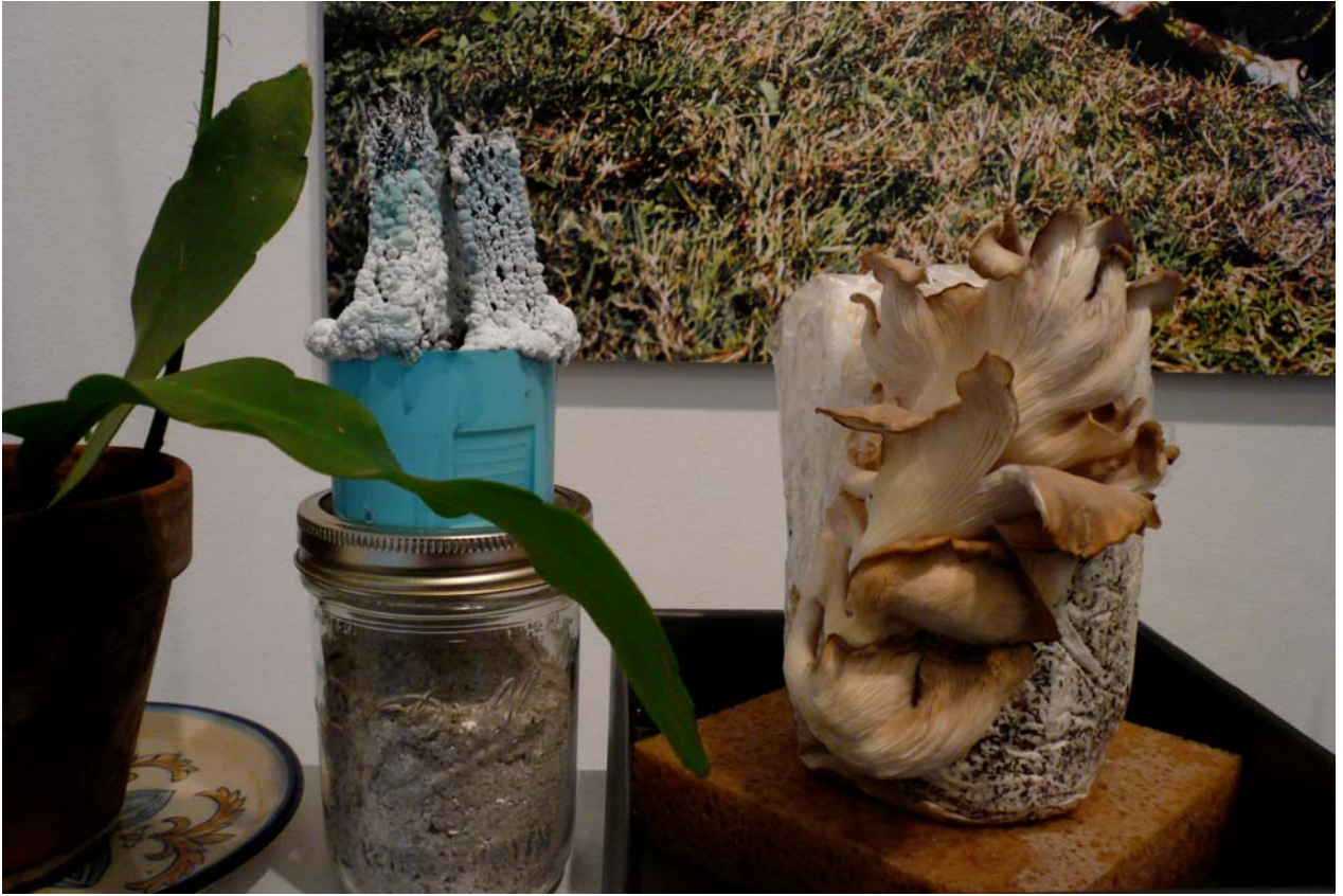
peace be with you , detail showing a Night Blooming Cereus, a jar of mica, a salt garden grown in the lid of a spray paint can, and a living Oyster mushroom