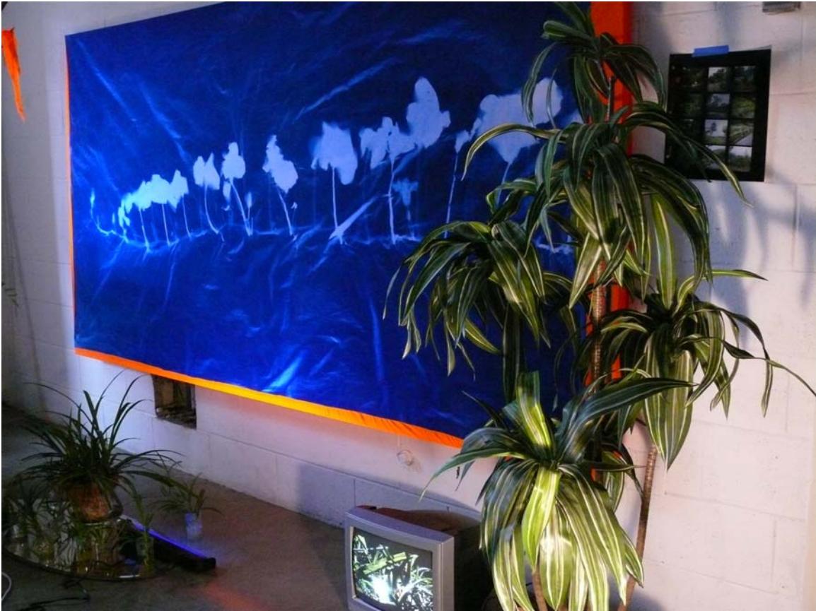
safety squash , with 54x120 inch cyanotype, 2007