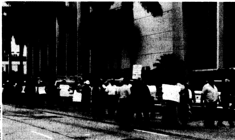
IBEW Local 728

The Associated Builders and Contractors rounded up the usual suspects—right-wing Republicans, realtors, scab contractors and the Chamber of Commerce—in their effort to thwart us at the