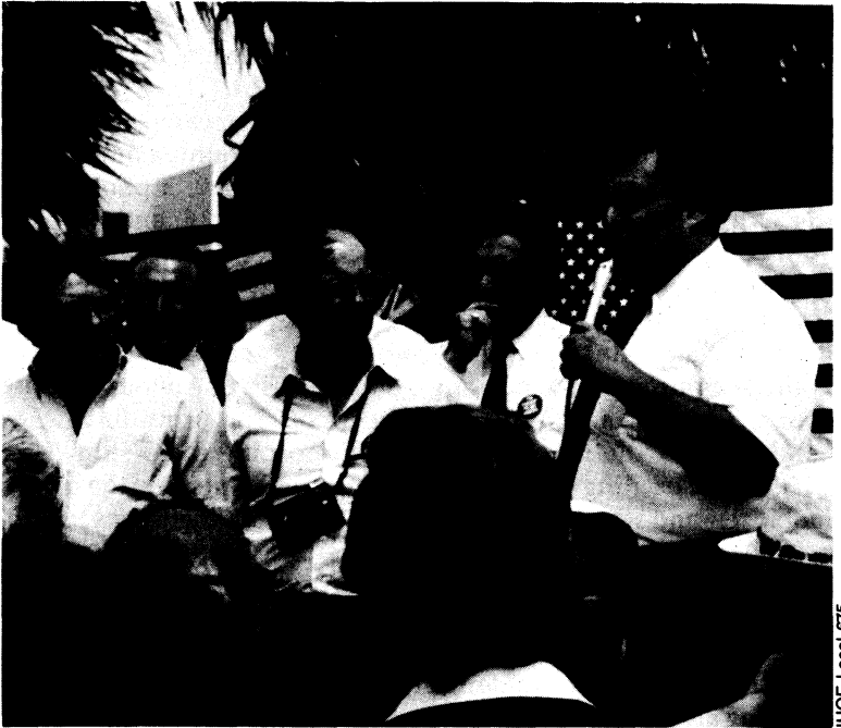
IUOE Local 675