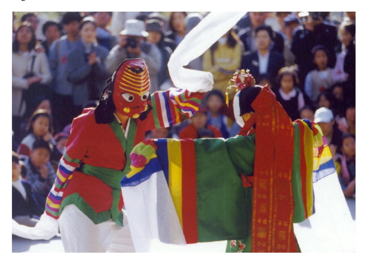
Figure 8. Talchum in Korea