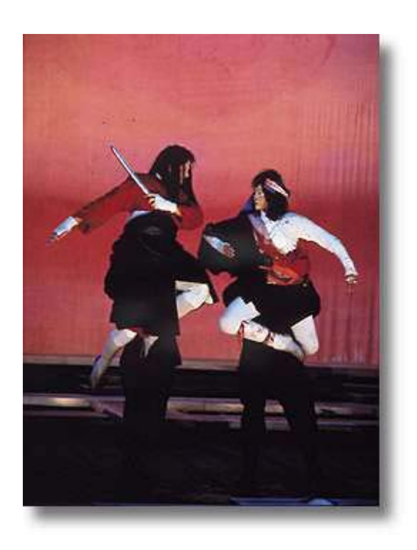
Figure 16. Ariane Mnouchkine's Tambours sur La Digue

Korea; especially, it was so interesting to me to see performers played as puppets being manipulated by puppeteers with the techniques of Bunraku (traditional puppet theatrical form in Japan). The main stage was composed of polished wooden floor, a sort of Japanese platform stage.