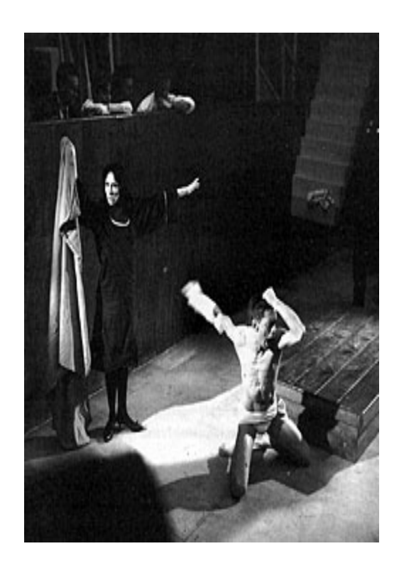
Figure 19. Grotowski's The Constant Prince , 1965