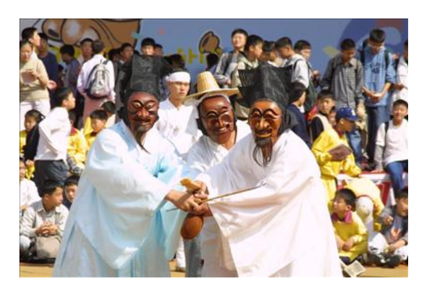
Figure 7. Talchum in Korea