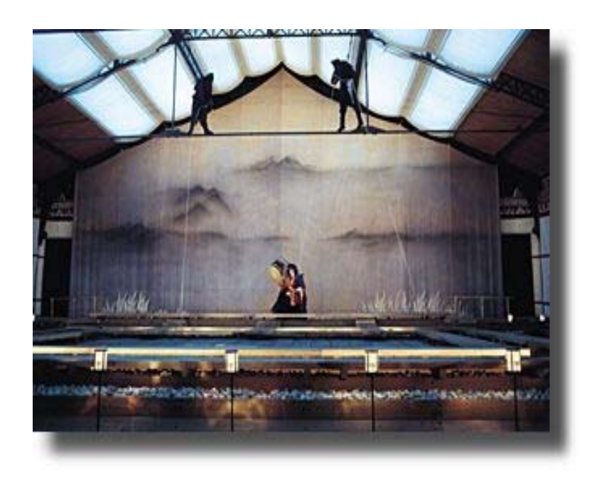
Figure 18. performing space of Tambours sur La Digue