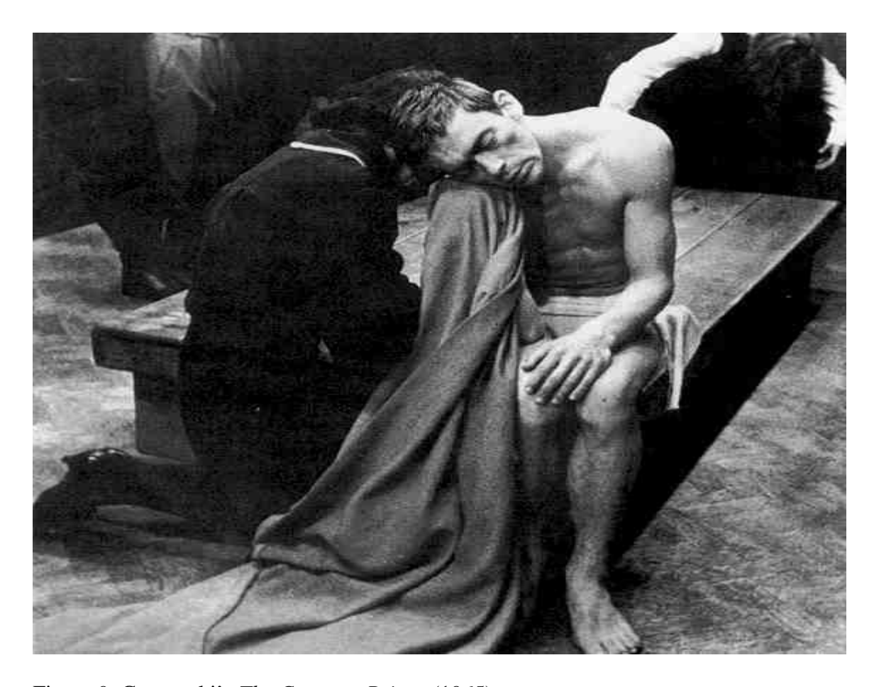
Figure 9. Grotowski's The Constant Prince (1965)

Spectators tended to be passive and the physical proximity throughout his spatial experiment generated a metaphysical distance...Cruelty of suffering within the action does not agitate anyone looking on. The cruelty and suffering is studied passively and reflectively without engagement. (Kerr 151)