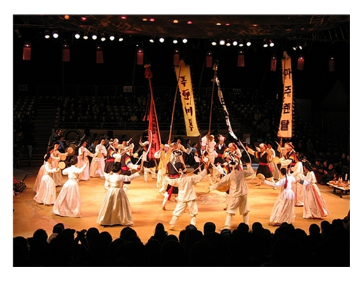
Figure 11. Madang Nori in Korea

Now what needs to be emphasized is that the process of the after ceremony or entertainment has an important meaning as much as performance itself. Originally, it was a traditional entertainment between performers and spectators to share food, liquor, and unexhausted fun. This process has implications such as settlement, purification, congratulation, consolation, and so on. Nowadays the after ceremony of Madang Nori is