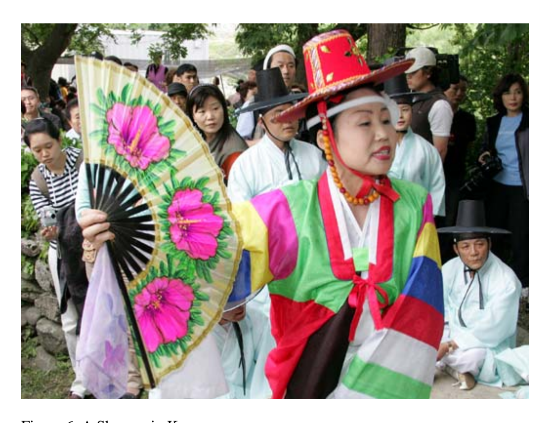
Figure 6. A Shaman in Korea