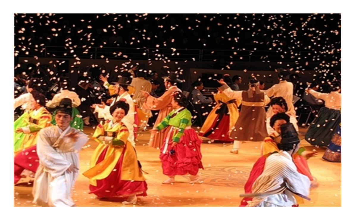
Figure 12. Madang Nori in Korea