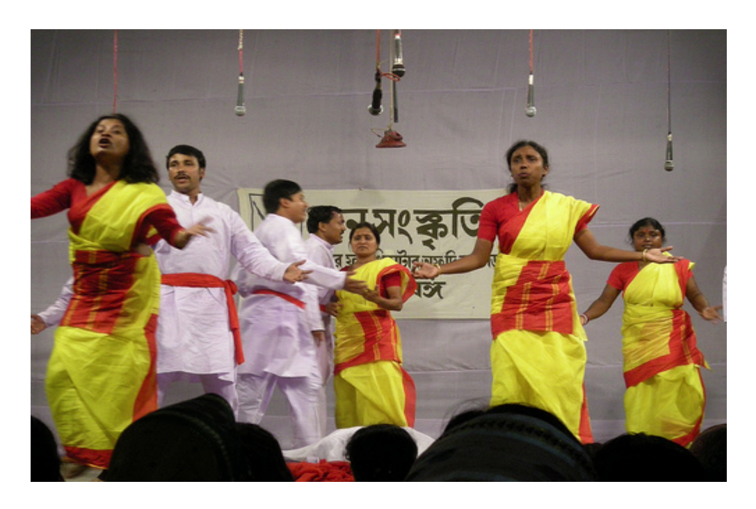
Figure 13. Indian Theater, Jana Sanskriti