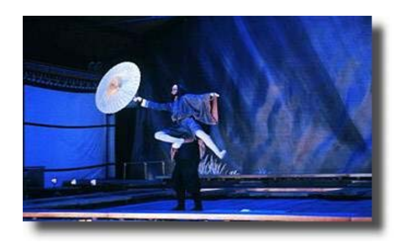
Figure 17. Ariane Mnouchkine's Tambours sur La Digue