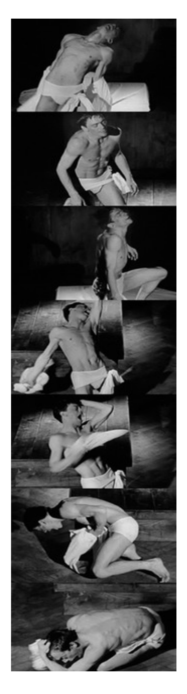
Figure 20. The Constant Prince, 1965