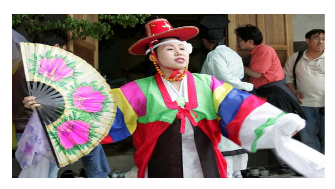
Figure 5. A Shaman in Korea