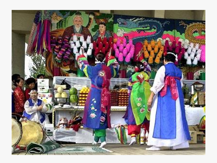
Figure 4 : The ceremony of exorcism by Shamans in Korea