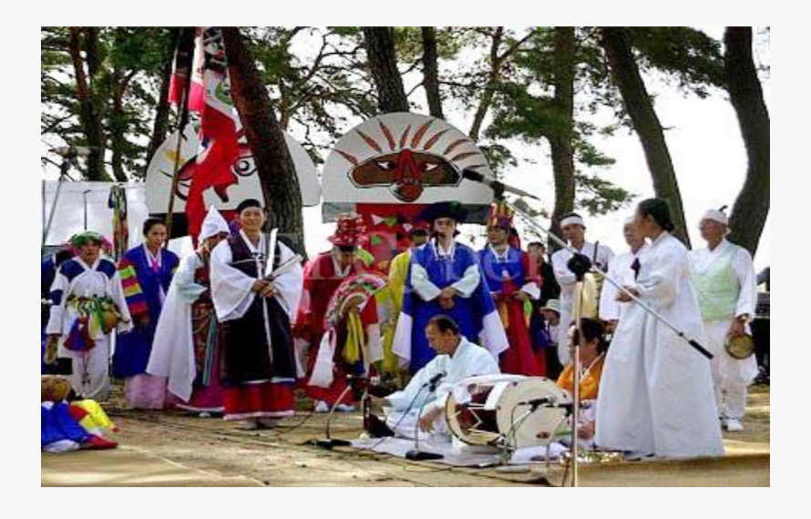
Figure 3 : The ceremony of the offering a sacrifice to spirits in the west coast in Korea for village's tranquility and a rich haul