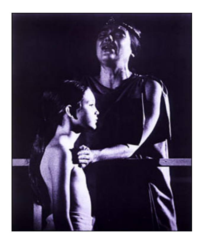
Figure 14. Andrei Serban's The Trojan Women