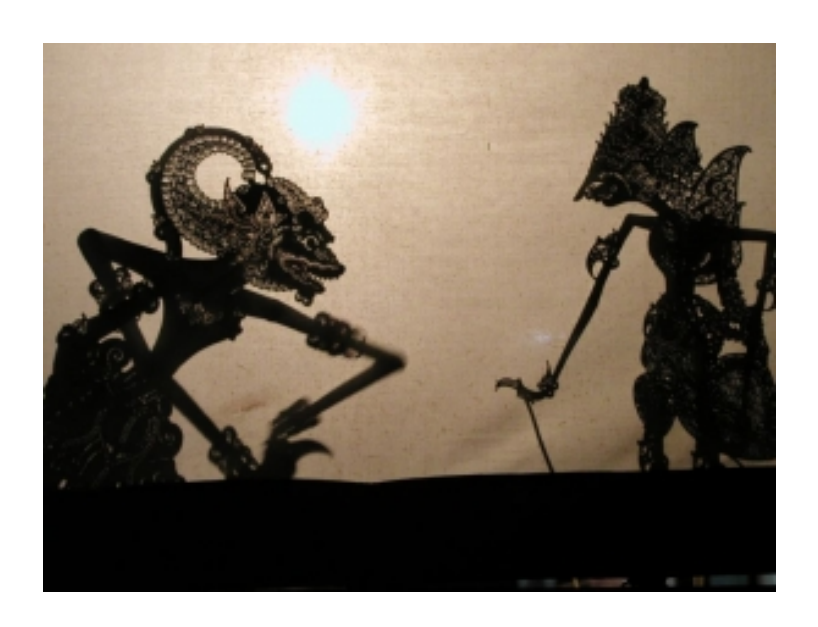
Figure 1. Wayang Kulit