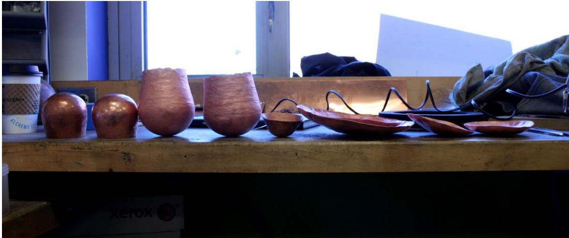
Fig 7 Curious Vessel Series , 2014 (Process Image)

processes from the past to make objects that are designed to function in the present. While I have it, I embrace the luxury of having the time to dedicate to making an object by hand.