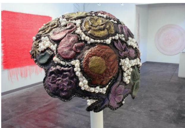
Fig 5 Distorted Archetypes: Sage , 2014

“We glimpse a stranger on the street, and the exchange lasts barely a moment. But then we go home and think on it and think on it and try to understand what the glance meant and inspect it from this angle and from that one, spinning futures and fantasies around it. The experience that lasted an instant plays out for a lifetime inside us. It becomes, in fact, the story of our lives.” 15 I am interested in the way that we as humans interact with each other, how we interpret and store that information as memory and story, how those stories stay with us, and how they influence who we become.