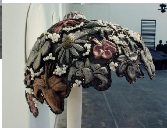
Fig 6 Distorted Archetypes: Sage , 2014

My characters, if I can even claim them as mine, are intricate, but they will never be as complicated as the