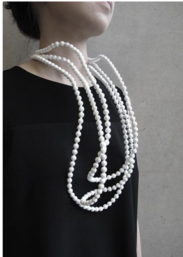
Fig 3 Kuntee Sirikrai, Hidden Moments , 2013

In the same way Kuntee Sirikrai's Hidden Moments series explores the deformation of time through the lens of a single moment. Time itself becomes distorted to find the fractures of a difficult memory in the search to understand. She isolates a moment of change, the time between the before and the after of an event when it can feel as if time itself is being altered. 7