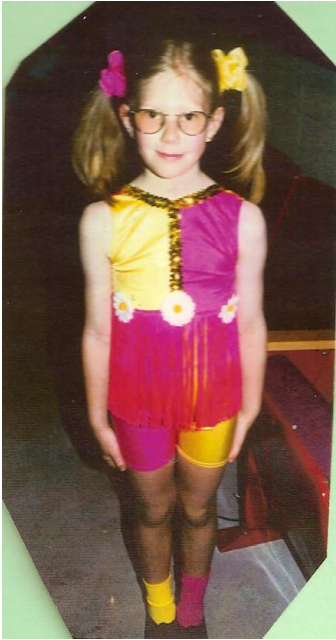
Fig 16 Dance Recital, 1998

Fueled by my deep-seated desire to figure out if practice really does make perfect I design work that allows me to repeat the same task hundreds if not thousands of times. What I have found through this approach to making is that by combining and layering a single gesture there is room for each mark to be imperfect because when seen as a whole the imperfections fade away. It is through repetitive process that I find a sense of clarity. There is a magic that only happens in movement: a state of mind that can only be reached through being present in your body. I was a dancer from age six to nineteen and even though it has been years since I've stood at a ballet barre the movements and mentalities I learned there will always be familiar to me. My hand remembers the steady comfort of the barres' stainless steel support as readily as the feel of the hammer I hold today. The physical and mental awareness that happens through metalsmithing is strikingly similar to that of dancing, where movement is derived from the desire to refine my abilities until precision is second nature. With each hammer blow, as with each plié, habits are formed and abilities are honed.