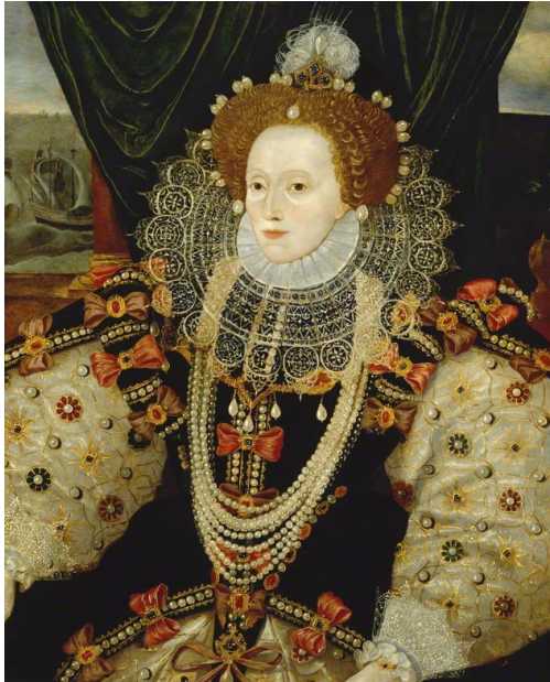
Fig 4 Queen Elizabeth I , Unknown Artist, 1588

the real gems remained safely locked away, or as a way to exaggerate the appearance of their wealth. 9