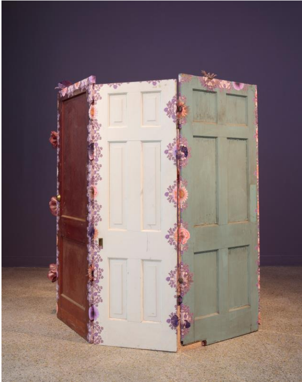
Fig 9 Thank You for a Lovely Time , 2015