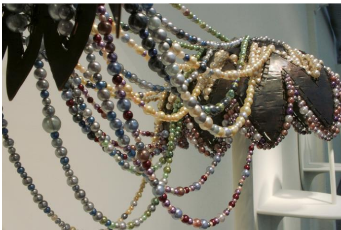
Fig 14 Distorted Archetypes: Twins , 2014