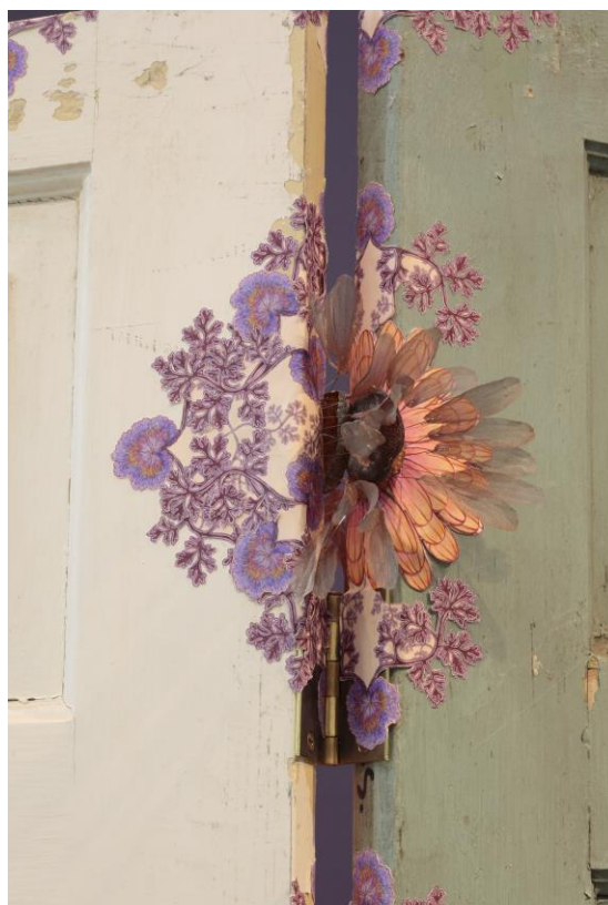
Fig 12 Thank You for a Lovely Time , 2015 (detail)

peer out of place of wonder, fantasy and possibility into reality, when inside the space it is easy to feel as if Wonderland may be through one of the doors in front of you? The possibility of what could lay beyond any of these doors is endless, making this space one of imagination and wonder. The small space can also be confining, positioning its occupants as caged, to be viewed from the outside like an animal at the zoo. There is power and vulnerability in both the internal and external vantage points. Outside it is easy and tempting to peer in, to explore the internal space from the slits between the doors. The inside is an enticing place of color and wonder, but can you enjoy it knowing that you are being watched from the outside, that there is someone peering in at you?