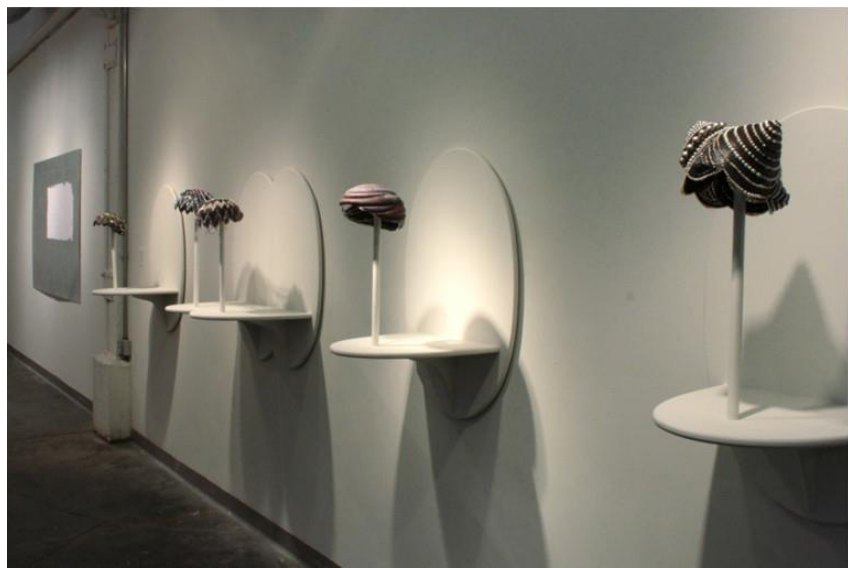
Fig. 1 Distorted Archetypes Series , 2014

I spend time trying to crawl into the minds of my loved ones and as a result, they have become a permanent part of me. The series that made up my candidacy