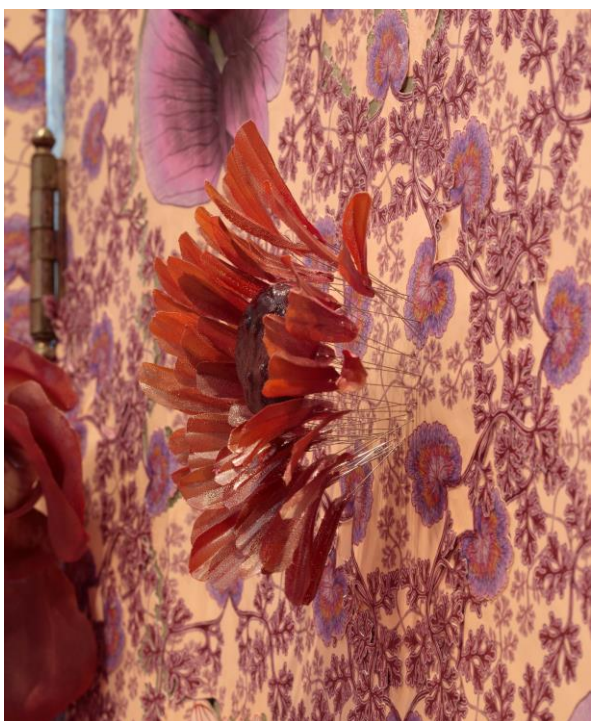
Fig 11 Thank You for a Lovely Time , 2015 (detail)