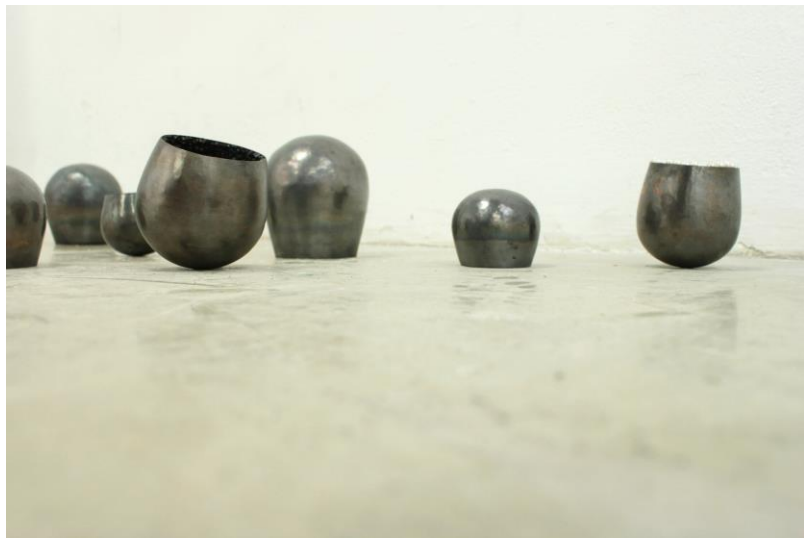
Fig 13 Curious Vessel Series , 2014

Thank You for a Lovely Time has acted as a way for me to understand my own patterns. When it comes to process I can be a bit obsessive. My approach has not changed since the days of making friendship bracelets but my materials have. It is difficult for me to think singularly, instead I think in strands of beads, thousands of hand-made jump rings, and series of vessels.