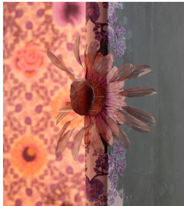
Fig 19 Thank You for a Lovely Time , 2015 (detail)

What if you didn't remember? What if I did tell? What if we had been more present? This cycle of self-conscious thoughts acts as a censor that is only quieted when my hands are busy, which gives me ample drive to hide behind the time consuming processes I cling to. Furthered by this cycle is my need to understand and to control, so I wonder