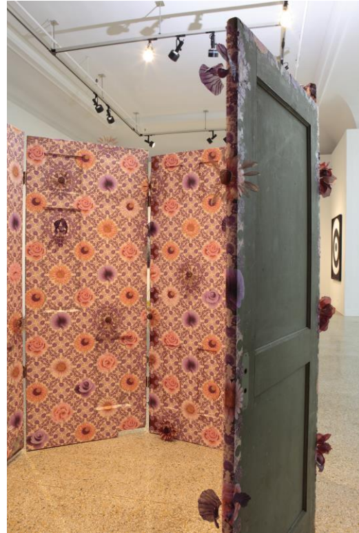
Fig 10 Thank You for a Lovely Time , 2015

and while they were implemented as a way to fix and to make sense of the pattern, the end result is that they have made any over laying pattern hard to find.