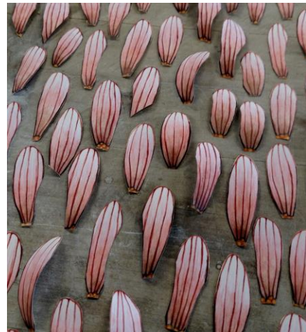
Fig 15 Thank You for a Lovely Time , 2015 (Process Image)