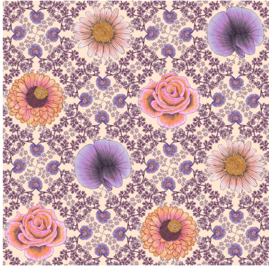
Fig 17 Wallpaper Pattern, 2015

Victorian Flower Language. The flowers I chose adorn the walls the same way I adorn myself and their meanings from some of the prominent memories and mantras that cyclically flow through my mind. To open a door into my