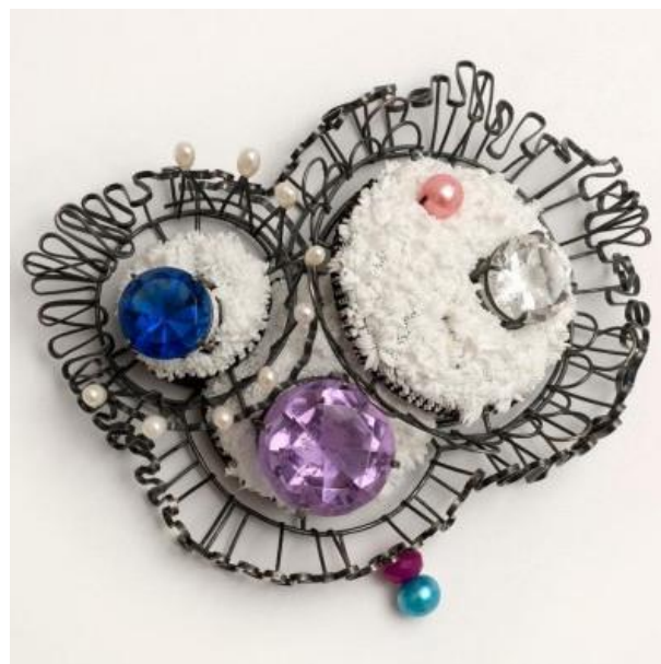
Fig. 2 Stephen Gallagher, Arcadian Brooch Triple Ruff Blue , 2008

Using altered remembrances as a tool it is possible bring together multiple times and places and allow them to interact with one another. 5 I see this same phenomenon when I look at Stephen Gallagher’s work. Using visual references from the Elizabethan era and the history of the decorative arts,