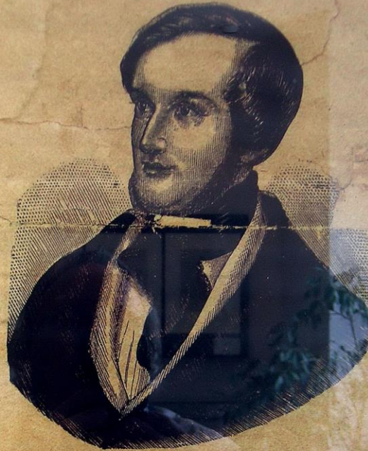
Richard Wagner ehemal. Kapellmeister und politischer Flüchtling aus Dresden.

652) Wagner, Richard, ehemaliger Kapellmeister aus Dresden, einer der hervorragendsten Anhänger der Umsturzpartei, welcher wegen Theilnahme an der Revolution in Dresden im Mai 1849 steckbrieflich verfolgt wird, soll beabsichtigen, sich von Zürich aus, woselbst er sich gegenwärtig aufhält, nach Deutschland zu begeben. Behufs seiner Habhaftwerdung wird ein Portrait Wagner's im Betretungsfalle zu verhaften und an königliche Stadtgericht zu Dresden abzuliefern sein dürfte, hier beigelegt."