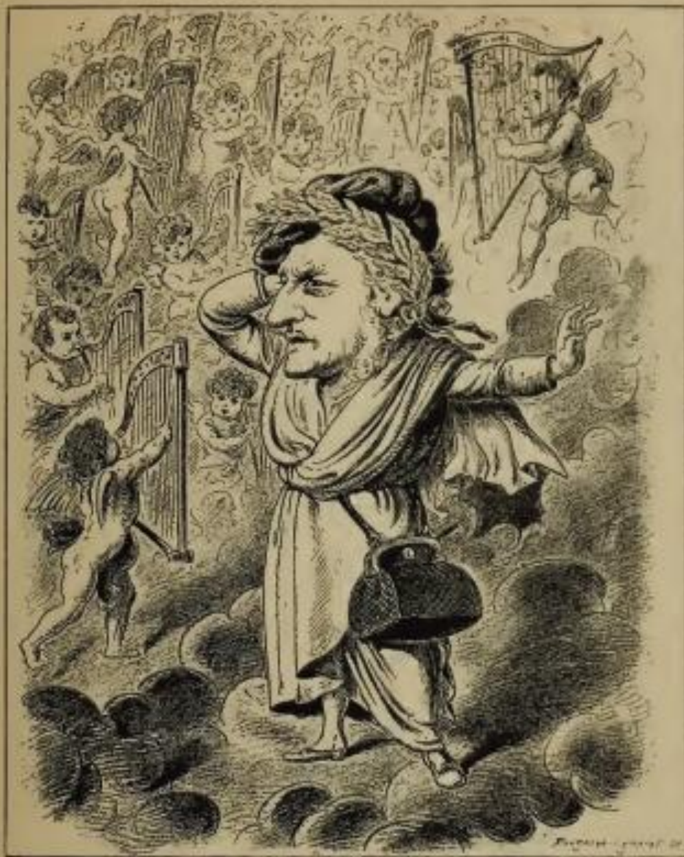
RICHARD WAGNER IN HIMMEL. — Richard Wagner am Ciel.

Richard Wagner zu den Engeln. — Meine lieben Engel! Der Empfang ist recht hübsch, aber ohne Pauken und Trompeten werden Sie nie eine Wirkung erzielen!