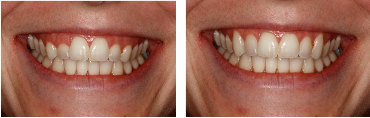
Figure 2: Before and after image of test patient