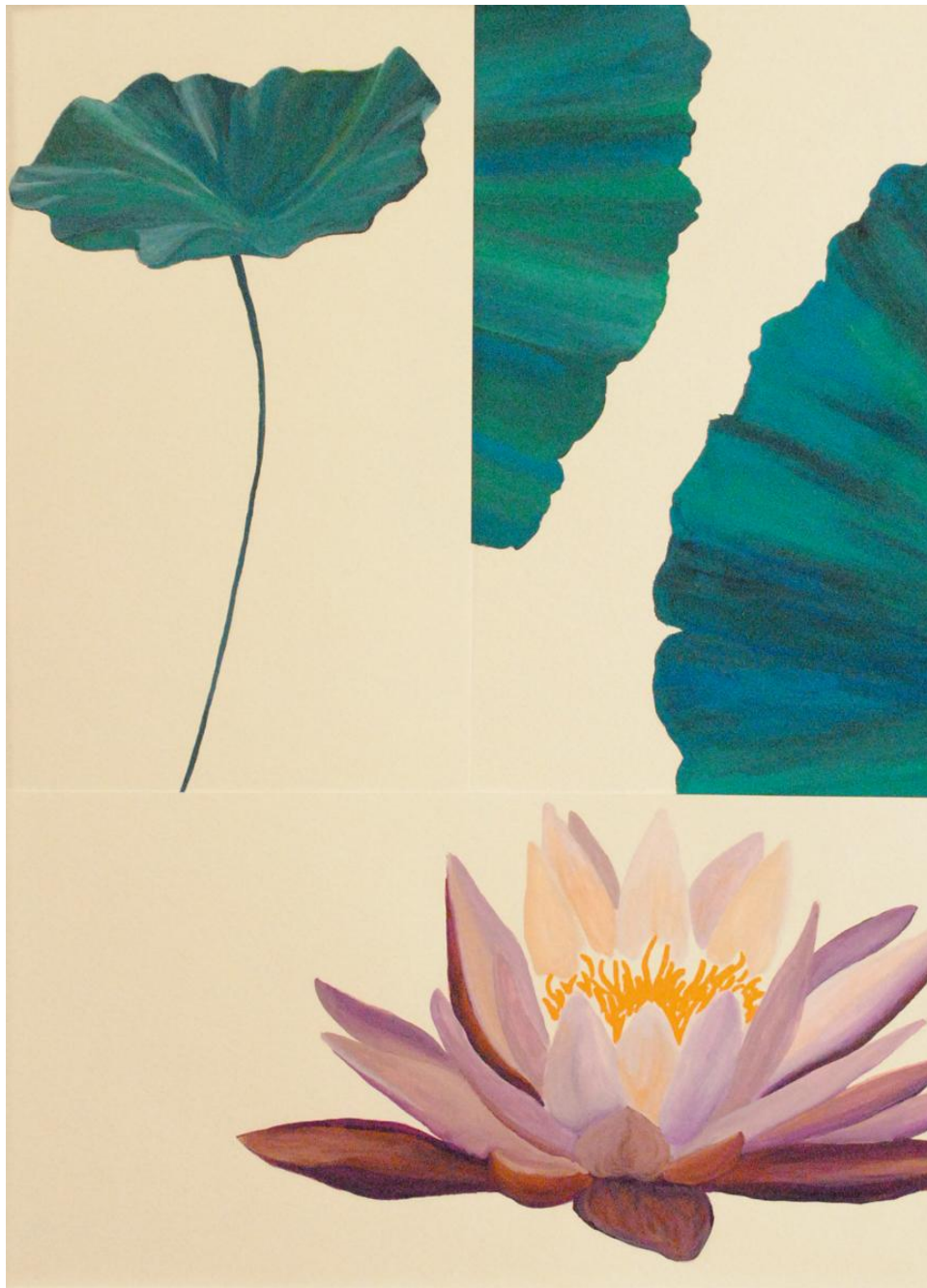
Figure 5. Lotus Blossoms , gouache on paper, 15"x11", 2012.