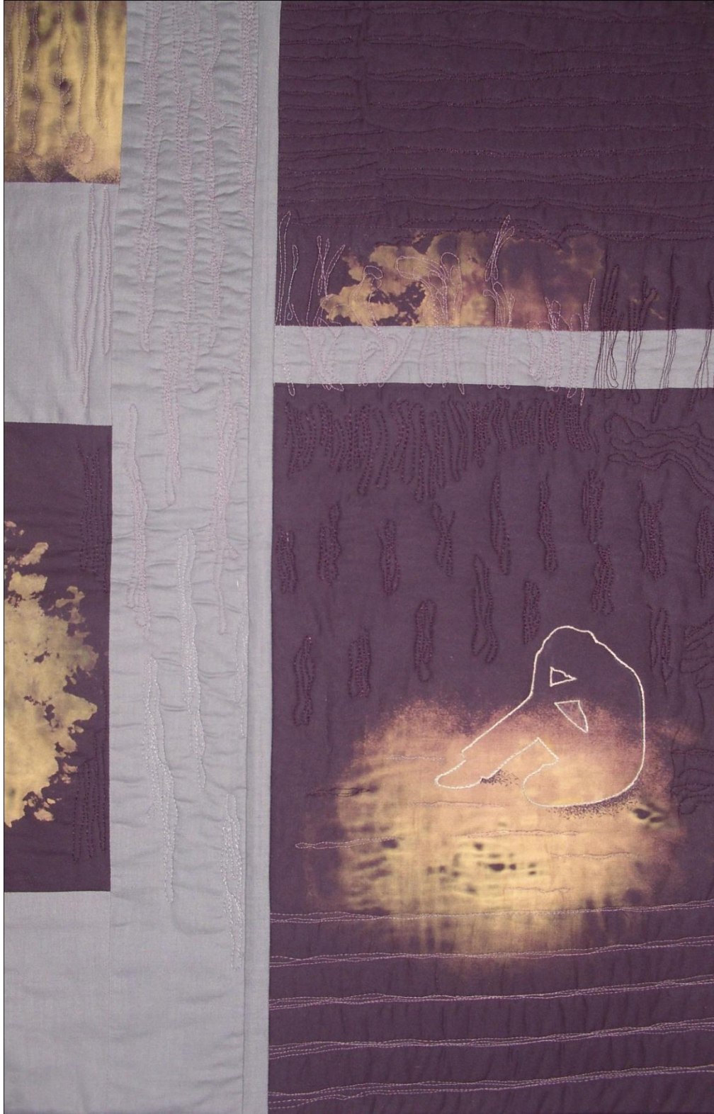
Figure 4. Worn , fiber, embroidered and printed fabric with machine quilting, 22.5"x18.5", 2010.