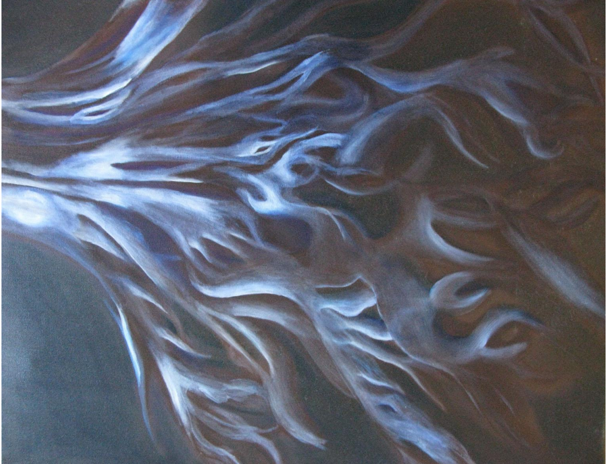
Figure 2. Calm and Chaos , oil on canvas, 22"x28", 2009.