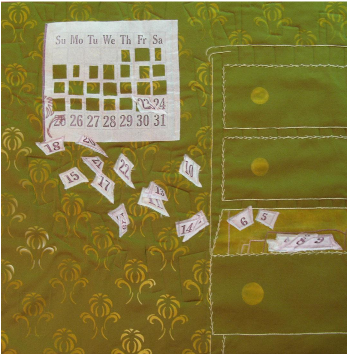
Figure 3. In My Dresser Drawer , fiber, embroidered and image transfer appliquéd on fabric with machine quilting, 22"x22", 2011.