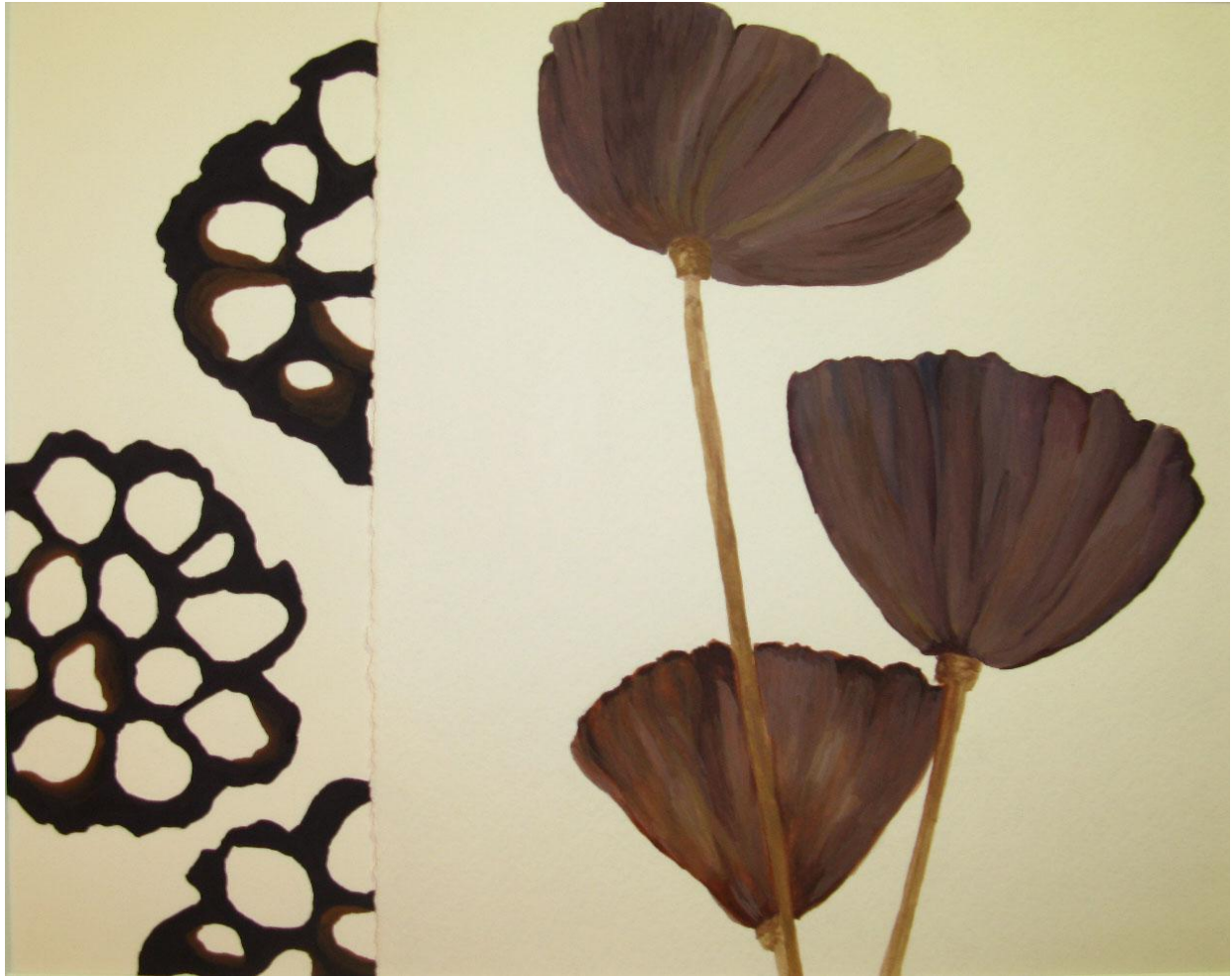
Figure 6. Lotus Pods , gouache on paper, 9.5"x12", 2011.